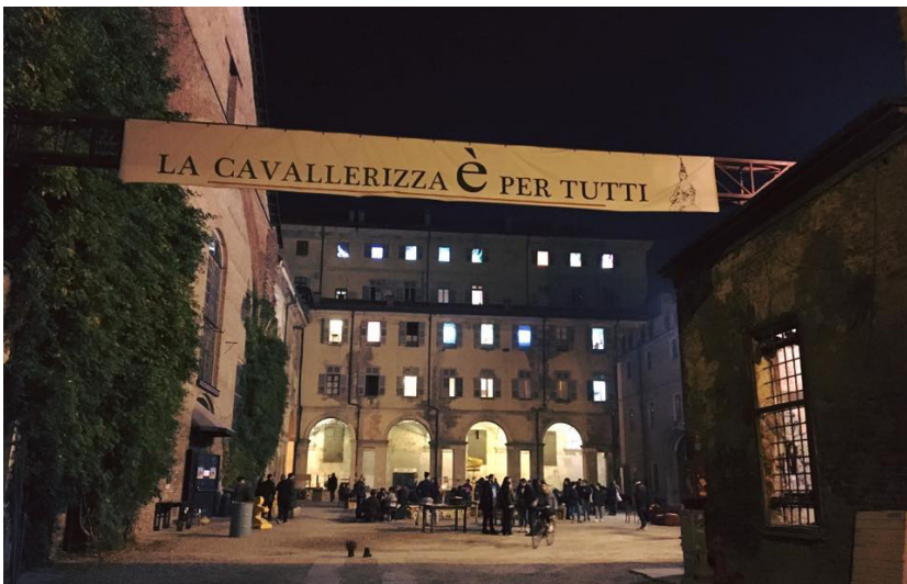
Fig 4. «Cavallerizza is for everybody» at the squat's entrance

Cavallerizza Reale is a building complex located in the city centre of Turin. Its construction started in the Baroque Age as a part of the Savoia's Zona di Comando and is as such part of the UNESCO world heritage site 'Residenze Sabaude'.