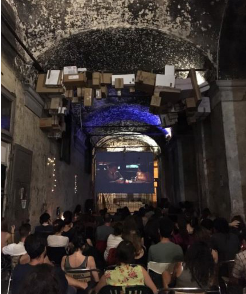
Fig 7. A cinema night

speak to a small part of the population.