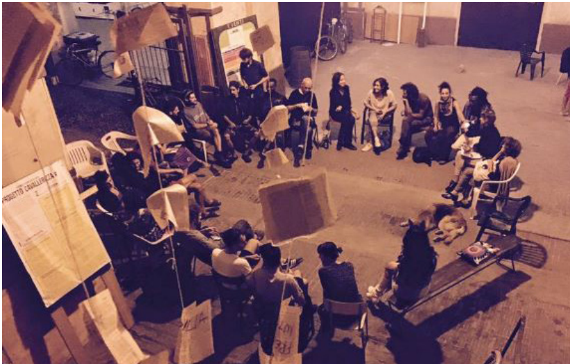
Fig 5. An assembly.

The movement’s main goal has always been to build a ‘Cavallerizza for everybody’, a public and open common. As a way to reach this objective ‘here and now’ all kinds of events have been organized: political meetings (not only related to the Cavallerizza itself), parties, public debates, workshops, courses, guided tours, calls to clean up the space, but also artistic events, such as concerts, performances, exhibitions. Artists have been present from the very beginning of the occupation in the highly heterogeneous group of squatters.