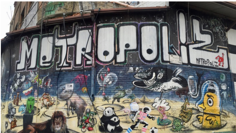
Fig 1. The entrance of Metropoliz