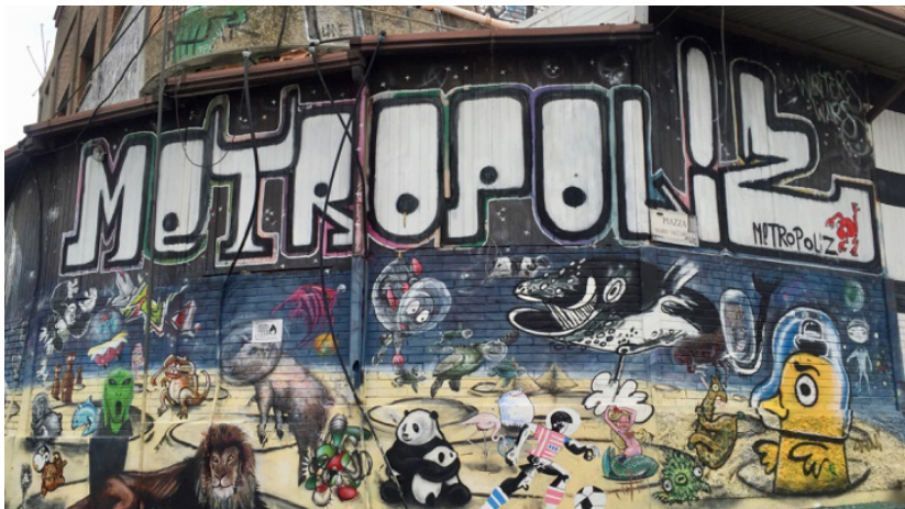
Fig 1. The entrance of Metropoliz