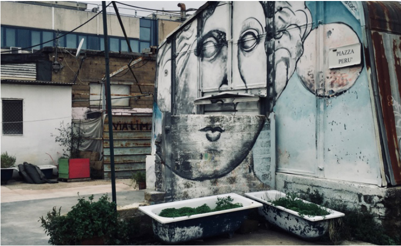
Fig 2. An example of self-organization: Piazza Perù

Unlike most residential occupations that often retain the name of the abandoned building, a key act was giving the space a new name. The name, chosen by the inhabitants and BPM activists, was inspired by both the Fritz Lang film and the urban dimension that the space suggested. This act of re-signification from the «former Fiorucci Factory» to «Metropoliz» was extremely important in the communication process of Metropoliz to the rest of the city to show that the space was no longer an urban void, but a container of a new and self-organised form of living.