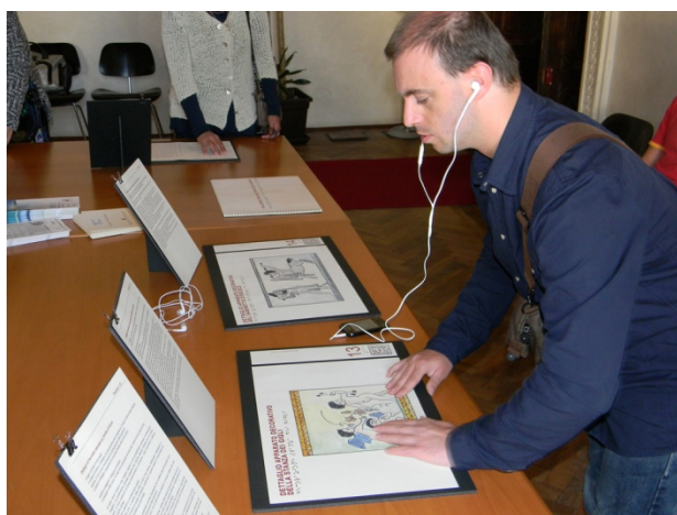
Fig. 5 Guided reading of a visual-tactile panel.

The goal is to offer multiple reading tools, products that can be used by everybody because they are created by taking into account individual skills, needs and ambitions, taking into account the many specific traits. The theme is steadily evolving through the many studies and research developed in the Italian and international framework, and through the growing availability and dissemination of technological devices, software and applications. There are many opportunities to be exploited, and many to be implemented to make the most of and enhance usability and accessibility of the cultural heritage.