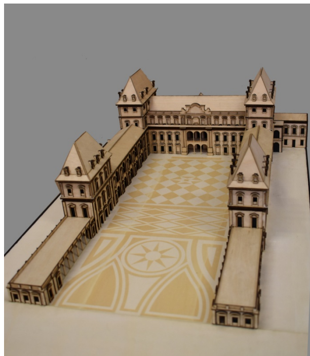
Fig. 2 Model of Valentino Castle, scale 1:200.

To meet tactile needs, considering that touch has a lesser discriminating capacity than sight, the drawings were simplified and “purified” of elements that complicate the “reading” of images on the part of the blind, precisely, the overly refined lines, the wealth of details, shadows, colour, use of perspective and of axonometric projections. The translation of images rich in details or of very complex images required the drawing to be broken up into a sequence in which elements that it would be either pointless or not productive to present in an overall picture are added from time to time to a constant basic structure.