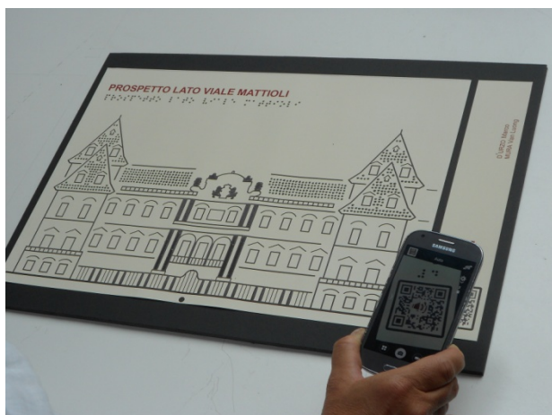
Fig. 4 Tactile table, view of viale Mattioli.

The direct ongoing discussion with the blind 5 , deemed the main bearers of interest, allowed to ascertain the efficacy of the processed material, both in terms of formal aspects and contents, and its repeatability in other sites of historical and cultural interest. The project's future developments focus on completing the knowledge pathway for the blind by creating tactile boards to be placed alongside the Italian and English captions for every room of the main floor and for the main decorative elements. At the same time the intention is to improve the informative material with videos for the deaf with subtitles and the translation in Italian Sign Language (LIS).