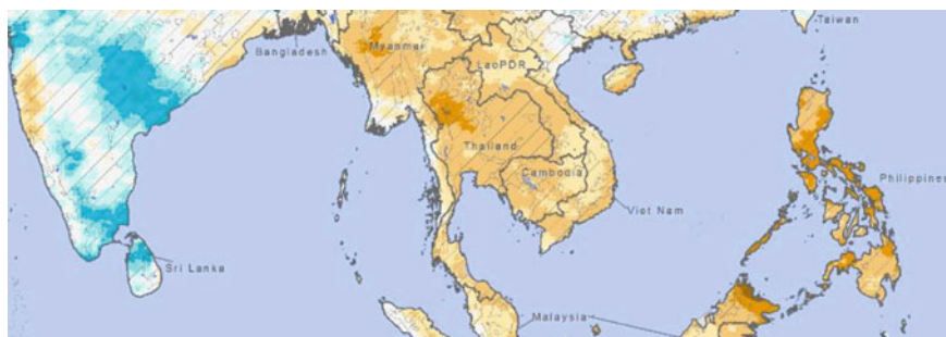
Fig. 9.1 Rainfall at end of June 2015: deficit ( brown ) and surplus ( blue ) (WFP 2015)

experiencing in recent years two extremes of water-related disasters, namely the 2011 floods and the ongoing drought started in 2014 that is causing severe water shortages issues across the country.