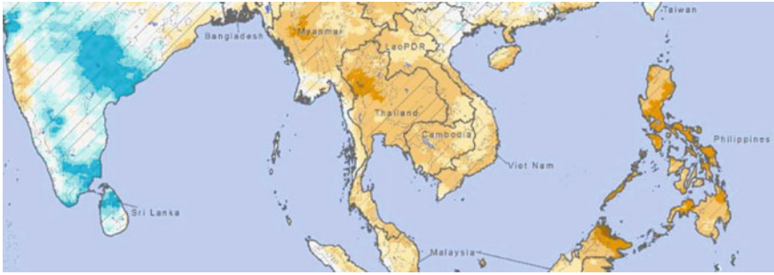
Fig. 9.1 Rainfall at end of June 2015: deficit ( brown ) and surplus ( blue ) (WFP 2015)

experiencing in recent years two extremes of water-related disasters, namely the 2011 floods and the ongoing drought started in 2014 that is causing severe water shortages issues across the country.