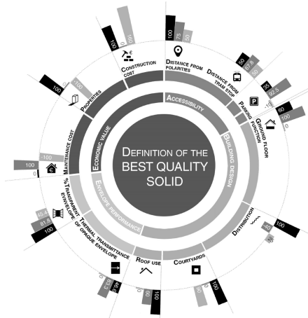
Figure CHAPN.2 Example of MACBETH priority ranking

quality of the buildings. Starting from the directions of the municipality of Brussels, each group of student has been asked to define the best architectural characters of a specific building typology. For sake of simplicity, we report here the analysis conducted for the “Heavy houses”, which are massive multi-functional buildings characterised by an external hard shell and a flexible use of internal spaces. In order to support this step of the process, the third phase of the IA framework provides the application of the MACBETH method.