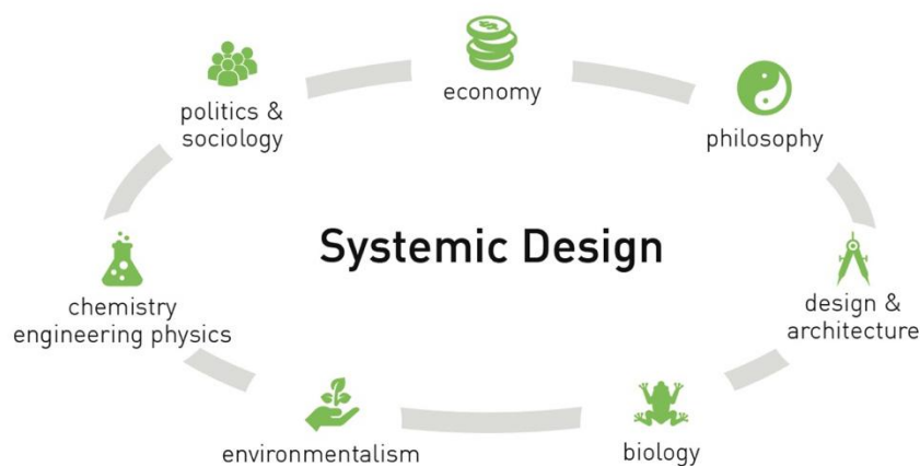
Figure. 1. A systemic designer plays an interrelational role between disciplines and eterogeneous professionals, fluidifying boundaries while creating new connections.

The interplay is not only an internal necessity, but a peremptory condition of its current being and of the responsibilities that design is tied to. Design becomes an intermediary among fields and disciplines for which new modalities of dialogue and common continuous knowledge are turned out to be essential in order to deal with the complex challenges of today and tomorrow. Designing is shifting from being an elitarian practice, to a common tool that everyone can use to modify, improve, forecast and create within a living world. Acting in design thus implies conceiving it as capable of systematizing worlds and strategies, considering the relations that influence and determine aspects, phenomena and mechanisms. The transition that is affecting design world is the detailed expression of dynamics that more widely concern the mutations of the system of knowledge. Signals of fluidifying processes among disciplinary boundaries are recognizable along with increasing multidisciplinary and interdisciplinarity, indicators of a developing trend placed on a transversal and permanent contamination among the branches of knowledge.