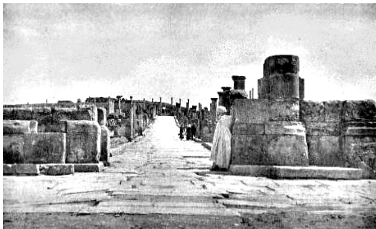
Streets of Timgad, from a photograph in [2]