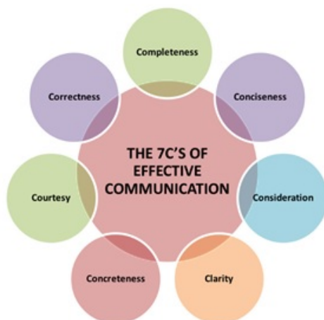
Fig. 5.3 – The 7C of effective communication

The first “C” means “ Completeness ”. The information conveyed in the message should be complete for the communication to be effective. The sender must take into consideration the receiver’s mindset and convey the message accordingly. Complete communication enhances the reputation of the sender and always gives additional information wherever required, it leaves no question in the minds of the receiver. This helps in better decision making as it serves all the desired and crucial information, persuading the audience.