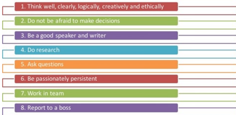
Fig. 5.4 – The 8 steps to improve marketing skills

Now let's move on to the concept of Digital Marketing , starting from the definition – which is not as obvious as it would seem – of digital marketing.