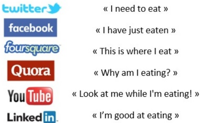
Fig. 5.5 – Different way of conveying messages on different social media platforms

Which Social Media is best suited to our needs? As in television and paper advertising, even in web marketing, it is fundamental to know how to choose the right channels. You need to know your audience and what's on Facebook, LinkedIn, Twitter, etc. As you know, every social platform is different in many ways: first of all, what we want to communicate and for which recipients' category. Let's try to explain in a funny way the differences between the 6 most used social platforms, through the example of a user who wants to communicate to the world his way of eating :