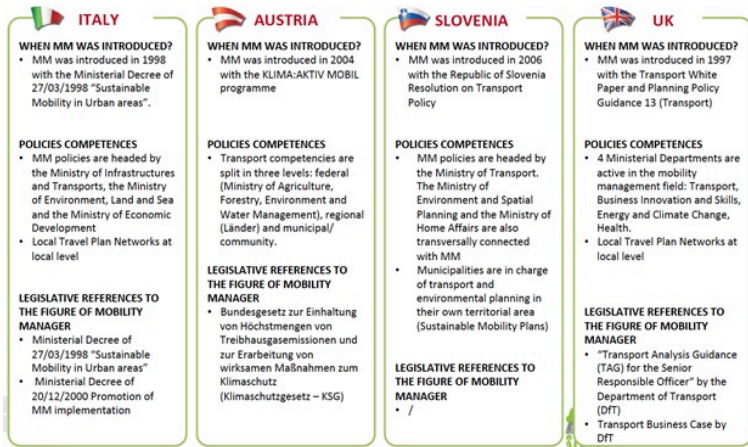
Fig. 1.1 – National contexts comparison

The situation between the various Countries considered is very different. In some Countries, the Mobility Management has long been part of the National legislation (as in Italy and the United Kingdom), which also provides a direct reference to the figure of the Mobility Manager. In other Countries (such as Austria and Slovenia), however, Mobility Management is considered in a more general sense, implicitly included in references to transport, sustainable development and planning as shown in Fig. 1.2 .