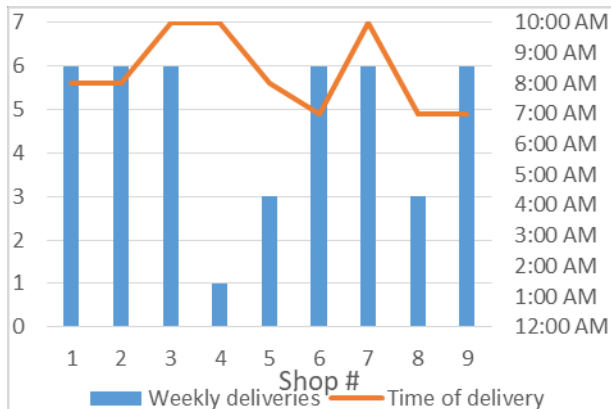
Figure 1 Weekly deliveries and time of delivery for the interviewed food shops

The food shops generally receive deliveries three or six times per week. In particular, six shops receive six deliveries per week, two shops receive three deliveries per week and the last shop receives only one weekly delivery. Moreover, they all prefer to receive their goods in the morning, before 10:30. This confirms the typical operations of LSPs that deliver the goods by the morning to local retailers and gather items to be shipped in the afternoon. Moreover, receiving goods before 10:30 means that LSPs have to pay for entering the LTZ and this cost is consequently borne by the retailer. Figure 1 shows weekly deliveries and time of deliveries for the nine food shops.