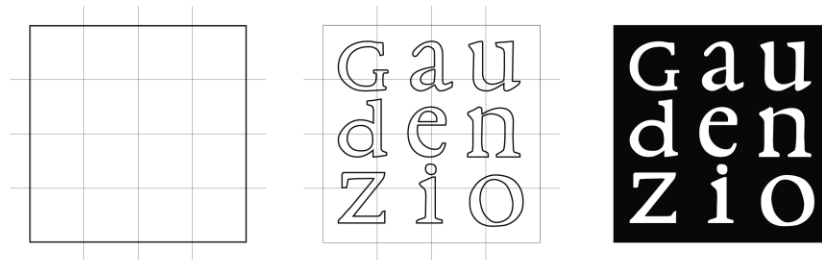
Figure 1. Design phases of the logotype.

conventional attractions, and leading to behaviors able to spin lively and productive dynamisms. A more focused work has been made along these lines structuring a digital platform, an open access app (Fig. 3) to share excursions proposals and other initiatives. We fostered the connections among the main actors, including designers and governance agencies, opening promising perspectives of contamination (Fig. 4). We collected lots of signals testifying that design will be the system of thought unavoidable from any sort of inquiry of future realities.