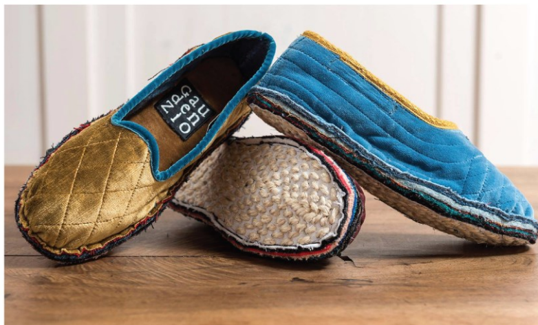
Figure 4. Scapin, a traditional local footwear, realized in a special version in tribute of Gaudenzio Ferrari.