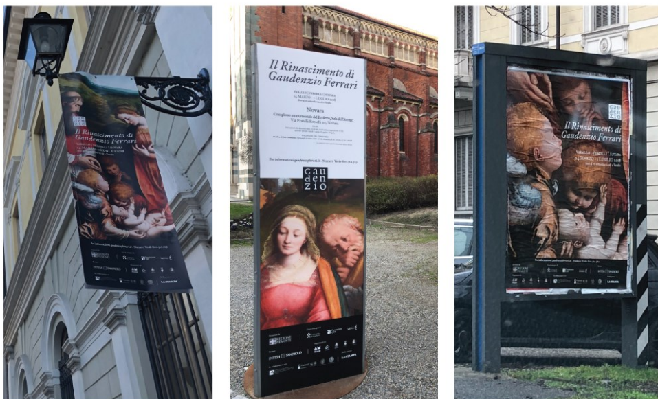
Figure 2. Visual advertisement of the diffused exhibition in Vercelli and in the region capital Torino.