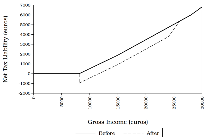
Figure 1: Net Tax Liability for an Employee

Taxpayers affected by \chi evaluate z as y - \tau + \chi , and those for whom \tau < \chi receive a subsidy. As an example, Figure 1 shows the net effect \tau - \chi for an employee without dependent individuals before and after the tax reform. Since the cash transfer decreases from 960 euros to zero in the income range 24-26 thousand euros, in this income range EMTRs increase to 80% (Figure 2).