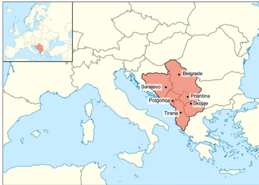
Figure 1 - Western Balkan Countries Included in the Analyses

After this brief introduction, the paper provides an overview of spatial planning in the WBR during the socialist period and discusses the main drivers of change. Section Three explores and compares the spatial planning systems of WBR countries through several variables: (i) the administrative and legal framework for spatial planning and the main planning authorities involved (subsection 3.1); and (ii) the spatial planning instruments produced at each territorial level and the allocation of development rights (subsection 3.2). Section Four discusses the main findings that emerged from the analysis as well as future challenges. Finally, Section Five rounds off the contribution, recalling its main objectives and advancing the need for future research.