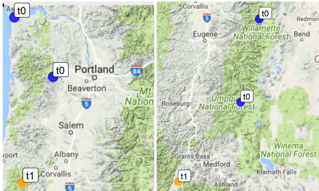
Figure 2. Oregon precipitations: Examples of mined FSTs