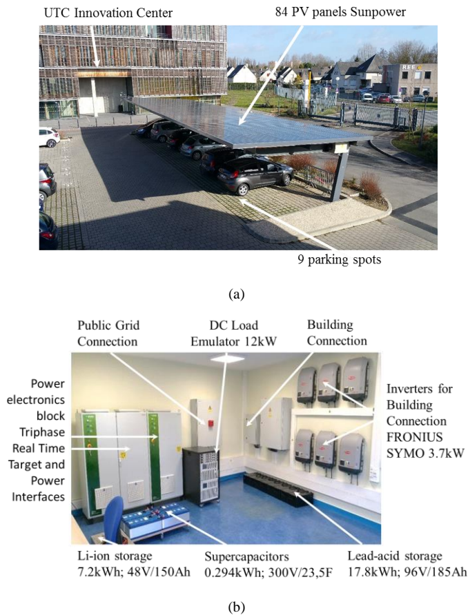
Figure 2. Technological platform STELLA: (a) PV panels covering 9 parking spots; (b) storages and power electronics.

STELLA is a microgrid demonstrator dedicated to EVs recharging and powering a building. This demonstrator, shown in Fig. 2, is based on PV panels covering 9 parking spots of the UTC Innovation Center, electrochemical storage, supercapacitors, power electronics, power grid and building connections. This platform, funded by the European Union (FEDER fund) under the CPER grant, is operational since December 2016 and unique in France at the academic level.