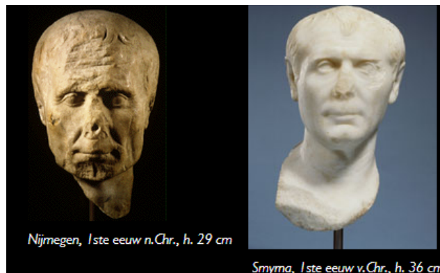
Figure 1: The two Caesar's heads in Leiden, as we can see in [10]. Let me stress that these images are here used only for scientific and cultural purposes.

Actually, at the web page https://elu24.postimees.ee/4509811/video-3d-busti-kohaselt-ei-olnud-julius-caesar-just-ilus-mees , we have a front view of Maja d'Hollosy reconstruction. So we can use it for a comparison, as given in [9], where it is shown that the Tusculum bust proportions were not properly considered.