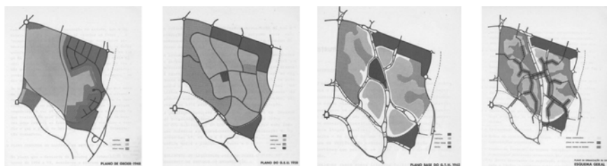
Figure 1. Evolution of Chelas' urban plan between 1948 and 1964

This layout was changed in a second and a third plan, Plano de Urbanização de Lisboa (Plano Director do Gabinete de Estudos de Urbanização) in 1959 and Plano-Base do Gabinete Técnico de Habitação in 1962. During that period a great migration from the countryside caused overcrowding in the historical centre. This situation led the technicians of GEU and GTH to design Chelas as a new urban pole for the eastern part of Lisbon.