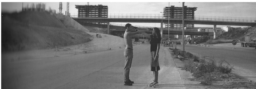
Figure 7. Image from Lisboa Capital do Nada , Marvila 2001

In conclusion, the actions promoted by these participative programs result interesting, especially for the processes (even more than for the results). The implementation of these projects is appreciable. However, they can be considered as a painkiller against a structural crisis that is not possible to be solved in that way. Place as Chelas needs social infrastructure. A network capable of taking care of the place and hold together and coordinate all these interventions. If this network would not be present in the future, probably the effects of this process are going to disappear (similar already happened in Chelas with the project Lisboa Capital do Nada , Marvila 2001). At present, it is necessary to think how is possible to create this infrastructure, that could be imagined as an endless workshop that aims to configure Chelas as “territory in continuous transformation”. Chelas, which is always been an incomplete area (waiting for the completion of the buildings, the realization of efficient infrastructures, the realization of the park, a good system of welfare), at present cannot expect the completion of what is missing. Today where all the transformation are stopped because of the crisis, this social network may be the only chance to rewrite this territory. A chance that is, at present, still too weak.