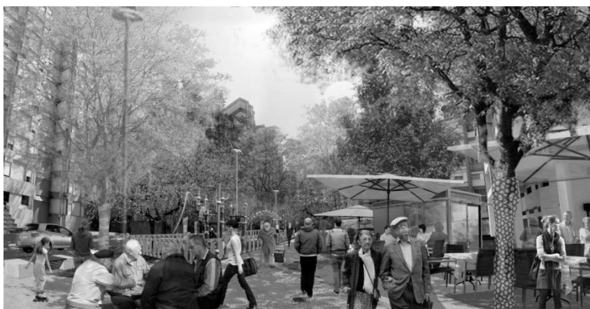
Figure 5. Viver Marvila, program of rehabilitation in Zona I

The program Viver Marvila, organized by the Câmara Municipal de Lisboa (CML) and the Instituto de Habitação e Reabilitação Urbana (IHUR) in 2008, aims to work with the population of Chelas for the redevelopment of the buildings and the public spaces ( Program of Integrated Intervention , 2013). The association is composed by architects and sociologists who carry out the instances of the local population in order to drive the actions of municipalities in Chelas. The program integrates social actions and urban regeneration operations. The residents' participation is necessary, but the public investment (in sense of financial operation, organization, designs and planning) is essential. The interventions with a major impact were realized in 2008 and 2009, when part of the buildings of the architect Tomas Taveira, known as “Corredor da Morte”, was demolished and the public spaces in the neighbourhood was upgrading. Starting from this point, many other small operations have been realized inside the neighbourhoods, such as the creation of pedestrian areas and the maintenance of the buildings. At the same time, the program Viver Marvila intervened also in the areas outside the neighbourhoods, in fact during the last three years, sixteen hectares of land were planned for urban gardens and a skate-park was created ( Program of Integrated Intervention , 2013). These actions are also linked to social initiatives in order to help the vulnerable population of Chelas.