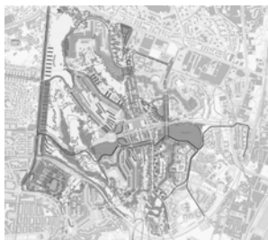
Figure 3. Plano de Pormenor do Parque Hospitalar Oriental

The first scenario still imagines Chelas as a unitary system that could be created by working on the spaces in between : the residual areas, the infrastructural axes, the abandoned waterfront. A huge territory formed by “ islands surrounded by the almost inaccessible sea of motorways” (Alves et al. , 2001, 24). In this vision the sea becomes the most important element that should connect all areas. The possibility of this approach has been showed by the plan for the Eastern Hospital Park designed in 2009 by the architect João Falcão Pedro De Campos with the landscape architects NPK. Despite many critical issues due to financial investment, the project still imagines Chelas as a unicum .