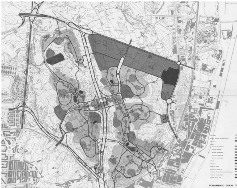
Figure 2. Plano de Urbanização de Chelas, 1964

dominated the 60s (Heitor, 2001,143). This change was due to the architect José Rafael Botelho, leader of the design team. Botelho learnt urban planning at Paris University and after he worked at London Council when he was strongly influenced by the theories of Team X. For this reason, Botelho rejected the normalizing vision of functionalism (need-type man-kind) in order to base his designs on the enhancement of plurality and cultural differences (Heitor, 2001).