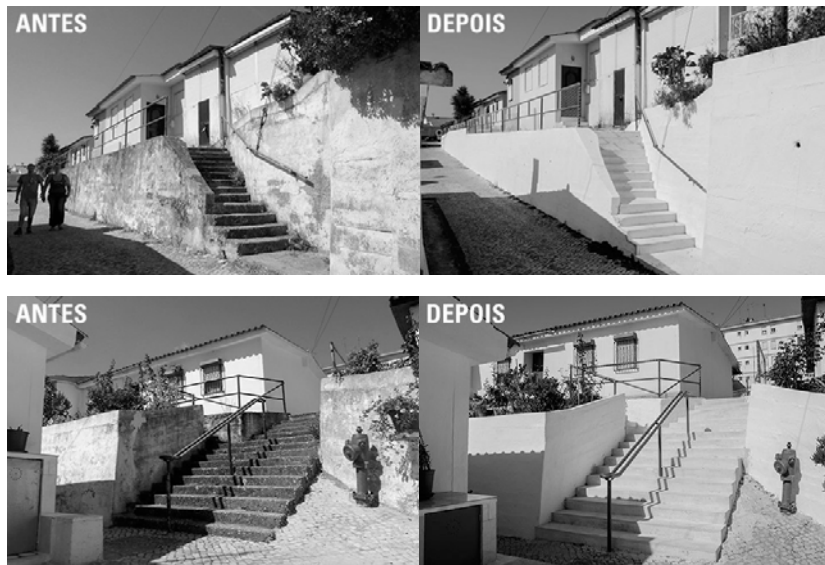
Figure 6. BIP/ZIP PRODAC NORTH, Ateliernob