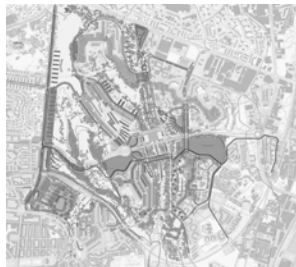
Figure 3. Plano de Pormenor do Parque Hospitalar Oriental

The first scenario still imagines Chelas as a unitary system that could be created by working on the spaces in between : the residual areas, the infrastructural axes, the abandoned waterfront. A huge territory formed by “ islands surrounded by the almost inaccessible sea of motorways” (Alves et al. , 2001, 24). In this vision the sea becomes the most important element that should connect all areas. The possibility of this approach has been showed by the plan for the Eastern Hospital Park designed in 2009 by the architect João Falcão Pedro De Campos with the landscape architects NPK. Despite many critical issues due to financial investment, the project still imagines Chelas as a unicum .