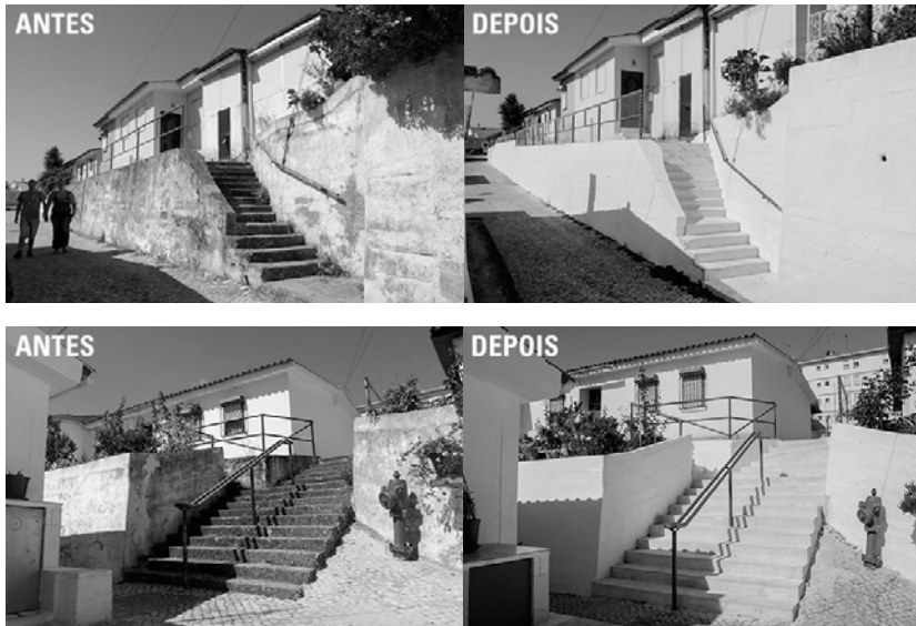
Figure 6. BIP/ZIP PRODAC NORTH, Ateliernob