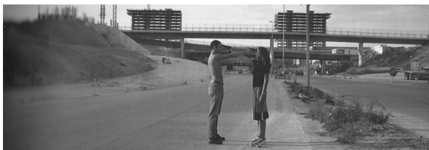
Figure 7. Image from Lisboa Capital do Nada , Marvila 2001

In conclusion, the actions promoted by these participative programs result interesting, especially for the processes (even more than for the results). The implementation of these projects is appreciable. However, they can be considered as a painkiller against a structural crisis that is not possible to be solved in that way. Place as Chelas needs social infrastructure. A network capable of taking care of the place and hold together and coordinate all these interventions. If this network would not be present in the future, probably the effects of this process are going to disappear (similar already happened in Chelas with the project Lisboa Capital do Nada , Marvila 2001 ). At present, it is necessary to think how is possible to create this infrastructure, that could be imagined as an endless workshop that aims to configure Chelas as “territory in continuous transformation”. Chelas, which is always been an incomplete area (waiting for the completion of the buildings, the realization of efficient infrastructures, the realization of the park, a good system of welfare), at present cannot expect the completion of what is missing. Today where all the transformation are stopped because of the crisis, this social network may be the only chance to rewrite this territory. A chance that is, at present, still too weak.