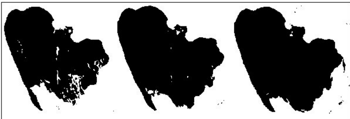
Figure 3: The binary images obtained from the images in Figure 1.

Each of the images is thresholded by means of a visual inspection of the histograms of the corresponding gray-tones. An example of thresholding is given in Figure 2 for one of the images in Figure 1. The best choice of the threshold is given by a gray-tone value between two peaks of the histogram.