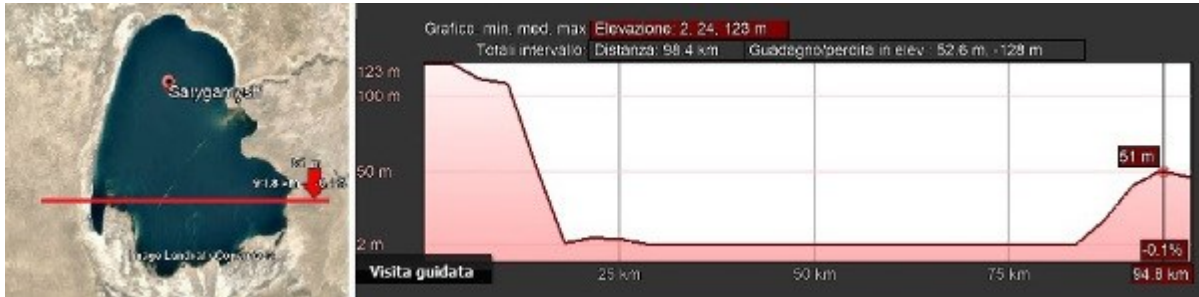
Figure 4: An elevation profile of Sarygamysh Lake that we can obtain by means of Google Earth.

on earth's surface. In the case of Google Earth, the software is providing a ruler for measurements, and also elevation profiles (an example is given in the Figure 4). In the case of the Figure 3, u corresponded to 333 meters. Therefore, the surface of the lake passed from 3412 km 2 to 4128 km 2 in 25 years.