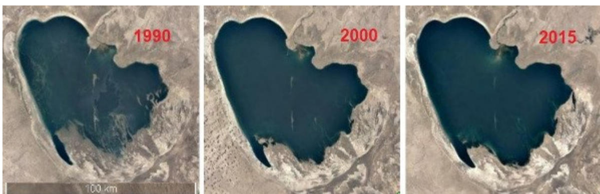
Figure 1: The Sarygamysh Lake in three images from Google Earth.

First, let us consider three satellite images from Google Earth, here shown in the Figure 1.