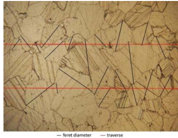
Fig. 2 Linear traverse method for determination of the grain size distribution

indicates a low level material. Is important to highlight that, according to the standard, this classification is valid only for calcitic marbles.