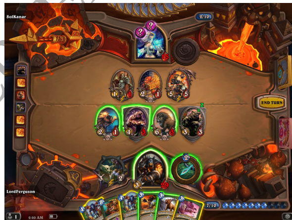
Figure 1: Screenshot of a HearthStone match.

Figure 1 shows a screenshot of a match confronting a Hunter versus a Mage.