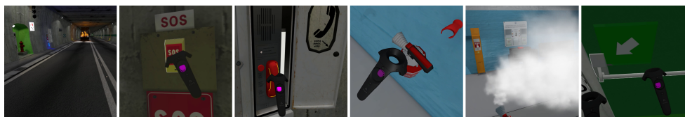
Figure 2: Screenshots from the FréjusVR application: fire event scenario and available interactions.

cylinder (one meter radius) around the user in order to prevent walk while preserving the HMD freedom of movement.