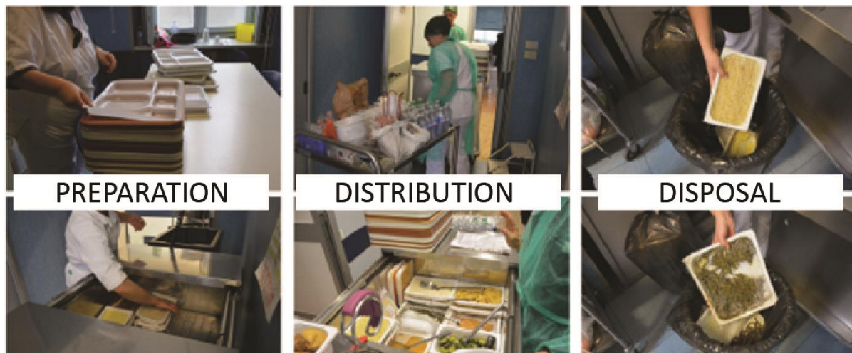
Figure 5. Extracts from the research phase: steps of food preparation and disposal.

The project addresses one of the most problematic issues in hospitals from the point of view of waste of resources by making the output of a process input for many others, acting locally to create a network of relations on the territory that enables the soundness of the system. The type of sustainability promoted is economic (reduction of the cost of waste disposal), environmental (reduction of environmental impacts related to the disposal) and social (enhancement of a resource donated to those in need).