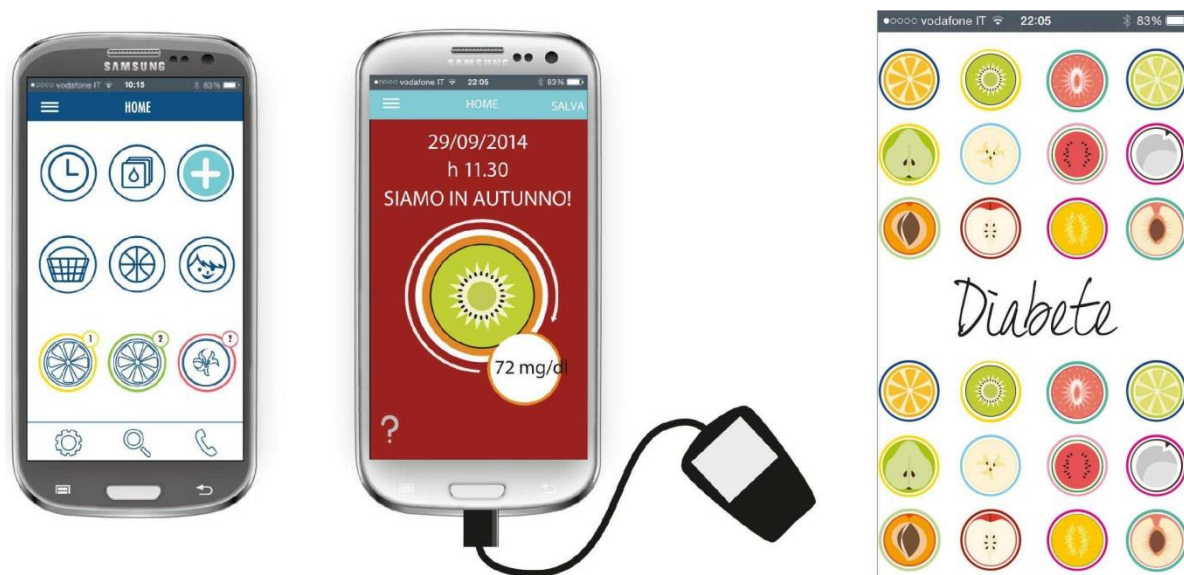
Figure 3. The app that developed for diabetic children.