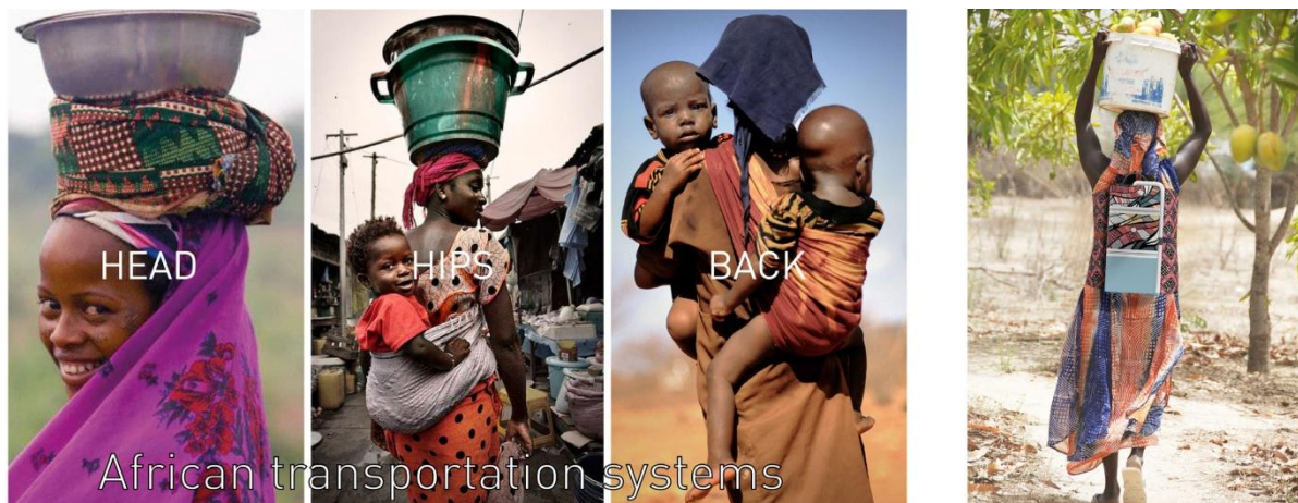
Figure 2. Extracts from the research phase.

The reuse of the filter (output) as a tool to purify water (input) is the core of the project developed to answer to human's basic needs and around them and in close relation to the local context it is shaped in order to ensure its social acceptance.