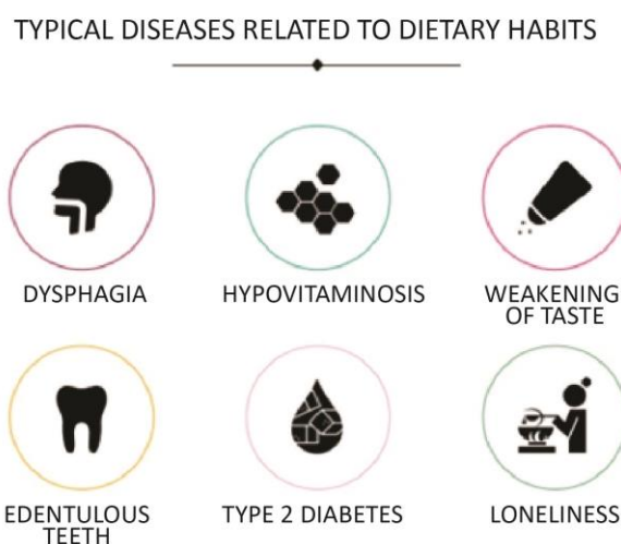
Figure 4. Typical diseases affecting the elderly.

Elderly have specific dietary needs, which are usually unknown to them. The project aims to provide elderly a guide for a balanced and healthy diet actively involving them in the project as promoters of local food and healthy lifestyles.