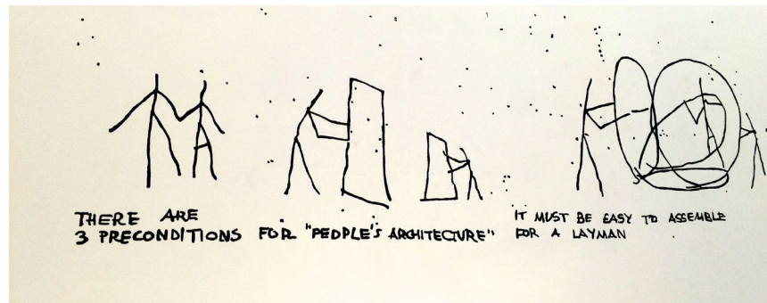
FIG. 5 People's Architecture

Being Explained to the Aliens (2016). These playful, yet serious, comics show all aspects of Friedman's way of analysing the world, underlining his recurring topics: the changing of cities, from being something enclosed and limited to the explosion of huge "nets of cities linked by fast trains"; the overbuilding of the Earth, linked to the much-ignored truths that "most functions do not need buildings" and that "Earth is overbuilt / Earth is overplanned"; the transformation of life conditions between 1950 and 2000; void as "raw material of architecture"; urban space as something "not created by architects", yet defined by the "use-pattern deployed by its inhabitants".