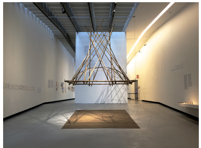
FIGS. 3-4 Space Frames