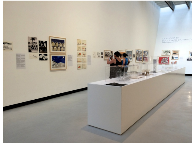
FIGS. 6-7 Boulevard Garibaldi

Far from being merely utopian, the exhibition helps to understand the roots of Friedman's theories and his down-to-earth approach to architecture and society, which is both deep and light, mirroring the architect's feelings of constant curiosity and cheerfulness, no matter one's age or background. Moreover, the exhibit also echoes today's interest for ephemeral architectures – such as shelters – and a renewed, almost nostalgic, attention to the so-called architectural "megastructure".