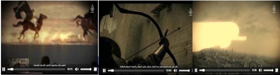
Figure 2. Mixing realities in the online video The Legacy of the Prophetic Methodology .

Here, the background nasheed emphasizes the escalation of IS assaults while the storyteller's voice stresses the emphatic resonance of the images. The long take on IS fighters also reframes and reinforces already introduced visual symbols of IS men riding horses in the desert, the weaving black flag, and the sharia principles, such as the return of the head (beheading), the zakah , the jizya , and the return to gold as the main currency. The various key topics narrated by the storyteller and visual symbols are edited in a combination of sequences filmed during the ongoing military operations in the Middle East and scenes probably taken from Hollywood historical movies. The blurred boundaries between fiction and reality, between a present condition and a mythical past, confuse the levels of storytelling, compelling the audience to focus on images and lose their critical approach. The same goal is pursued by articles published in Dabiq , although the textual medium makes it more difficult to mix the various storytelling levels. The text follows a sequential structure, and semantic gaps may be more visible in an article than in a movie, especially when the sequences are so well edited.