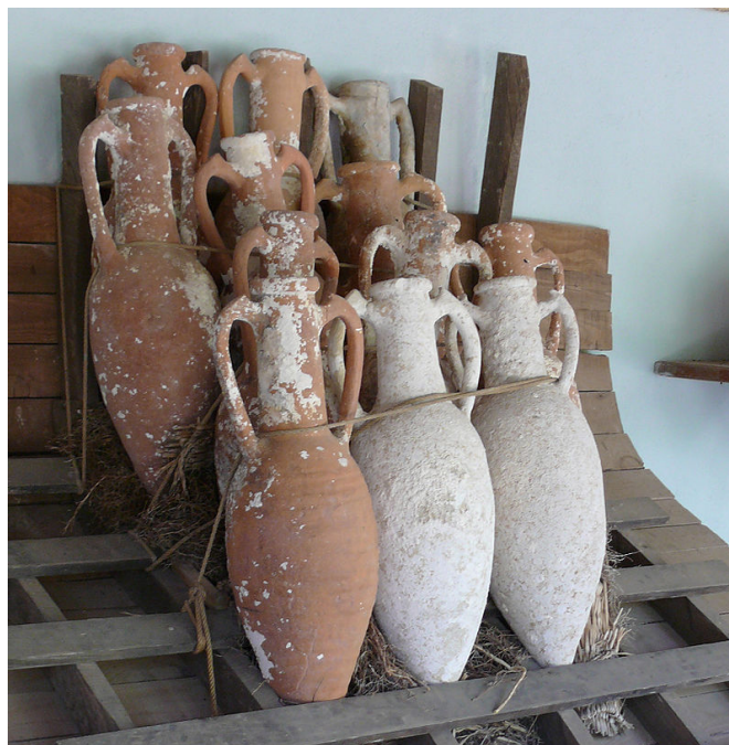
Figure 3: A suggestion on how amphorae may have been stacked on a ship.

An previously told, some amphorae found the mound are still bearing their tituli picti. These tituli were “painted or stamped inscriptions, which record information such as the weight of the oil contained in the vessel, the names of the people who weighed and documented the oil and the name of the district where the oil was originally bottled. ... The tituli picti on the Monte Testaccio amphorae tend to follow a standard pattern and indicate a rigorous system of inspection to control trade and deter fraud” [16]. The procedure was the following: the empty amphora was first weighed, and its weight marked on the outside. “The name of the export merchant was then noted, followed by a line giving the weight of the oil contained in the amphora (subtracting the previously determined weight of the vessel itself). Those responsible for carrying out and monitoring the weighing then signed their names on the amphora and the location of the farm from which the oil originated was also noted. The maker of the amphora was often identified by a stamp on the vessel's handle” [16,17]