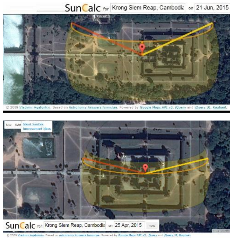
Fig. 8. Alignments on day of the summer solstice (upper panel) and on the day of one of the zenith passage of the sun (25 April). The azimuth of the sunrise on the day of the zenithal sun is about 76.2 degrees.

Barnhart and Powell have discovered that Angkor temples had vertical zenith sighting tubes too. “Though it is not apparent from the outside, each one of the beehive shaped temples of Angkor are hollow on the inside. Walking in and looking straight up, the roof is open all the way up to the top and that top has a hole where the sun shines in. We were told by the temple attendants that the holes on top of the roofs were there because the capstones had all been knocked off by erosion or more commonly by looters searching for jewels. Finding these fallen capstones among the rubble around the temples was our first surprising clue. Most capstones were beautifully carved as lotus flowers and all had a hollow tube running down their axes. Each had a very straight, long tube that would have let only true zenith passage sun light down into the temples. Whether or not this was their intention, functionally this makes every single temple of this kind at Angkor a zenith tube” [29]. Besides the temples which are beautiful artificial caves for the zenithal sun, the authors have observed that this