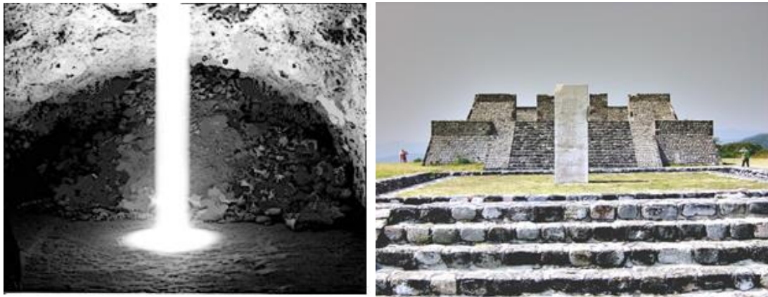
Fig. 1. On the left: the image illustrates how it looks the shaft of light in a cave passing through a tube in its ceiling, when the sun has its zenith passage in the sky. On the right: a pyramid and the ceremonial pillar at Xochicalco, Mexico.

The people of pre-Columbian Mexico had a specific “astronomical instrument” to observe this passage: a vertical zenith sighting tube inserted in the vault of an underground structure. One of these instruments is at the observatory of Xochicalco, in the Mexican state of Morelos. The image in the Figure 1 (left) illustrates how it looks like the shaft of light passing through the ceiling of the artificial cave of Xochicalco. A vertical opening produces in a dark chamber a perfectly perpendicular beam of light, when the sun is passing through the local zenith. Besides the cave, at Xochicalco there is a white stone pillar in the ceremonial area that could had been used to observe the shadow disappearing when the sun reaches an altitude of 90 degrees (Figure 1, right).