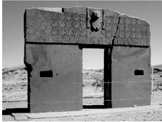
Fig. 2. The Gate of the Sun at Tiwanaku.

The Zenithal Sun in Sri Lanka. The zenith passage was important also for people of Asia. And in fact, in [24], we have shown that the archaeological complex of Sigiriya, the Lion Rock, in Sri Lanka has its axis oriented to the sunset of day of a zenith passage of the sun.