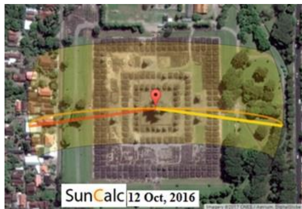
Fig. 9. The zenith passage of the sun on 12 October 2016 at the Sewu temple complex.

The temples of Java. The temples we are considering for our discussion about the connection of the zenith passage of the sun and architecture are the Sewu, Prambanan and Borobudur temples in Java. The Sewu temple, an eighth century Buddhist temple complex, is predating the nearby Rara Jonggrang, simply known as Prambanan, by over 70 years and the Borobudur by about 37 years. Prior to the construction of these temples, probably the Sewu temple served as the main temple of the kingdom [32]. Since Candi Sewu was built before the other two temples, we can suppose that it was a model for them, in particular for what concerns the number of ancillary temples and stupas (in Java, “candi” means “temple”).