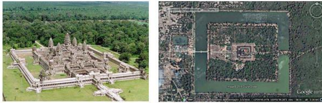
Fig. 7. On the left, aerial view of the central structure. On the right, the Angkor Wat surrounded by a moat used for helping stabilize the temple's foundation [31].