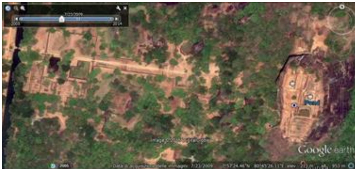
Fig. 3. The Sigiriya archaeological site in Sri Lanka. On the right, the Lion Rock.

Sigiriya is a huge palace built by King Kassapa I (477–495 CE) on the top of a granite rock, the Lion Rock [25,26]. This site is in the heart of Sri Lanka, dominating the neighboring plateau, inhabited since the 3rd century BC, and hosting some shelters for Buddhist monks. A series of galleries and staircases, having their origin from the mouth of a gigantic lion made of bricks and plaster, provide access to the ruins on the rock. From the satellite images, it is possible to see the site surrounded by a wall and the rock inside. At the summit of the rock, there is the fortified palace with its ruined buildings, cisterns and rock sculptures. At the foot of the rock we find the lower city surrounded by walls. The eastern part of it has not yet been totally excavated.