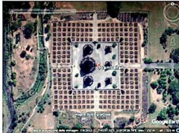
Fig. 13. Simulation of a satellite view of the reconstruction of the Prambanan temple, as proposed in [37].

It is not simple to determine the number of ancillary temples of Prambanan from the satellite images, because many of the smaller temples have been not yet restored. Let us follow the reconstruction suggested by the symmetry that the temple probably had and by the image we find in [37]. We have the Figure 13, in which we can see the 224 ancillary temples.