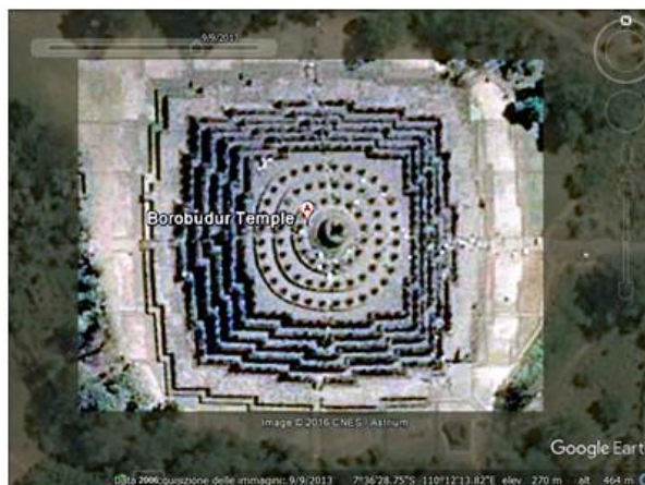
Fig. 14. Borobudur in Google Earth.

It seems therefore that the Sewu temple and the Prambanan are linked to astronomy; the Sewu temple is connected to the sun moving about the December solstice, whereas the Prambanan is linked to the sun moving between the zenith passages about the June solstice.