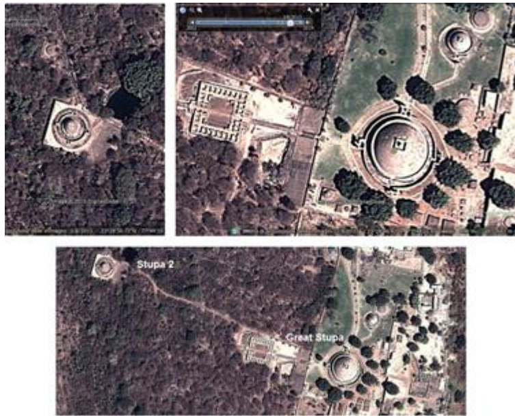
Fig. 5. N. Kameswara Rao had investigated the orientation of Sanchi stupas [27], showing that they could have been planned to be oriented towards the moonrise and the sunset on the day of Buddha purnima (purnima means "full moon"), the birthday of Siddhartha Gautama.