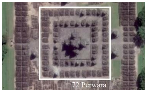
Fig. 11. The central part of the temple contains the main temple and 72 ancillary temples.

Let us try to connect these numbers to the number of the temples in the complex. Actually, the first and the second rows of the Sewu temple, those inside the couples of the apit temples, are composed by 72 small ancillary temples (Perwara) (see Figure 11). It seems therefore that a connection of the even number of Perwara to the number of the days from the zenith passage of October to the solstice of December is possible.