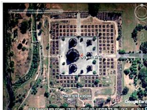
Fig. 12. The Prambanan temple as given by Google Earth.

Probably, the people who built the temple determined the zenith passage of the sun according to the observation of the stars. For instance, “one can see that a particular star would always rise at a certain point a few days before such or such a zenithal sun, hence it would be possible to know beforehand the exact date of any given sun.” [34,35] It means that 71 days are 72 nights (inclusive counting), and this legitimates the use of the corresponding even number, equal to the number of Perwara.