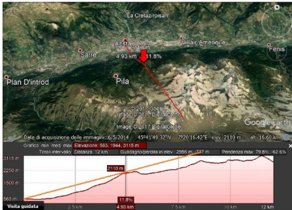
Figure 4: We can use Google Earth and its tool for showing the elevation profile. So, let us consider a straight line passing through Aosta. The sun, for being seen by an observed in Aosta, must have an altitude greater than the angle between the yellow line and a horizontal line. This angle is given by: \arctan [(2110-563)/4930] = 17.42 degrees.

As a conclusion, we can tell that the Kardo of Aosta is aligned along the azimuth of the appearance of the sun on the natural horizon, on the day of the winter solstice. To obtain this result, we have used SunCalc.org software (Figure 3) and the Google Earth elevation profile (Figure 4). By means of this case study, we have seen that a remote archaeoastronomical analysis of a site is possible, when we have to consider the role of the natural horizon as relevant (another example of this approach was given in [18]). For what is concerning Aosta, other evidences are furthermore supporting the astronomical orientation of the Roman town, as given in [13].