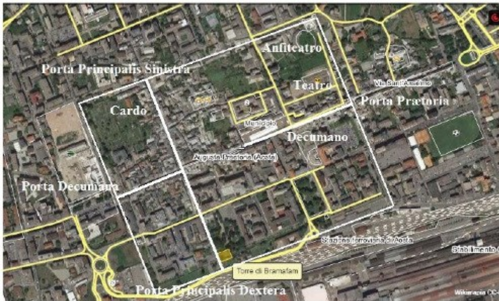
Figure 1: Augusta Praetoria in Wikimapia. The "Torre di Bramafam" is occupying the area of the Gate Principalis Dexter of the Roman town.