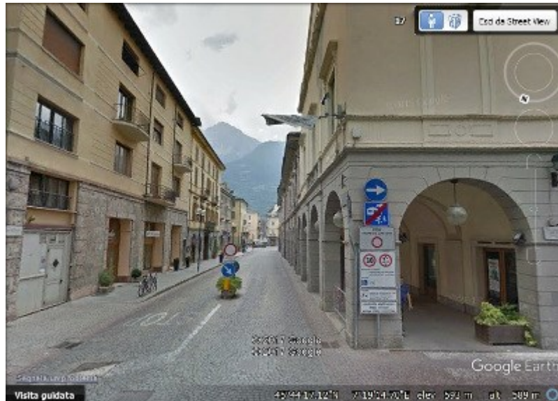
Figure 2: A Kardo of Aosta, seen by means of Google Earth in the Street View mode, in the direction looking at the 'anterior part' of the town.

In [11], among the towns considered for the analysis of the astronomical orientation according to the sunrise azimuth, we find Augusta Praetoria, the town that we are using here as a case study for illustrating our remote archaeoastronomical analysis. In 2013, the same town had received a further investigation by Stella Bertarione and Magli, with an approach based, this time, on the natural horizon [13]. The archaeoastronomical analysis of the Roman layout was made in [13], "taking into account the complex natural horizon of the Alps in which Aosta valley is nested". As told in [13], the "results show that the town was very likely oriented in such a way as to pinpoint Augustus associations with the cosmic signs of renewal: the winter solstice and the Capricorn". Actually, as we will show in the following discussion, it is the Kardo having the main role in the astronomical orientation allowed by the local environment. In [13], we find that it has a natural orientation according to the winter solstice. For Aosta, the orientation of the Kardo is more relevant than that of the Decumanus.