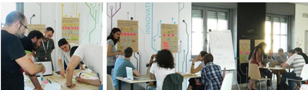
Figure 1. Groups working to define their use patterns based on the platform rules and objects.

This task requires an important abstraction effort, but the initial drawing of the project workflow giving a general framework to the participant proposals contains it. At the same time, rethinking a workflow on the basis of flexible and aggregate entities in space and time usually lead to highlight new elements in the story and explore the operational context from a different point of view, enriched by ideas, constraints and use patterns defined by other groups in the same workshop.