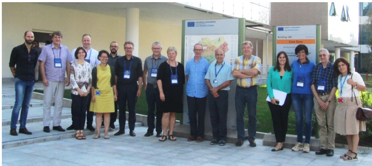
Figure 2 Invited experts and JRC participants to the workshop.

In order to ensure dissemination of the results of these activities in both communities (INSPIRE and energy efficiency of buildings), a proposal will be made to the organizers of the INSPIRE conference next year (early September 2017) to devote time and effort to have the building energy society involved in, e.g. Theme on Energy in Built Environment . DG ENER and DG ENV could be contacted to elaborate this proposal, taking into account the relationships of the energy related Directives, such as the EPBD, the EED and the voluntary initiative of the Covenant of Mayors with the INSPIRE Directive. The DGs that could be involved are DIGIT (the ISA 2 programme), ENV (INSPIRE), ENER (Smart Cities), RTD, GROW and JRC (research on INSPIRE, location interoperability and support to energy policy).