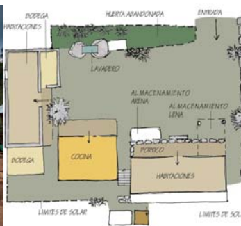
Fig. 5 - Investigation sketch of a Santacruz Tepetotutla project.