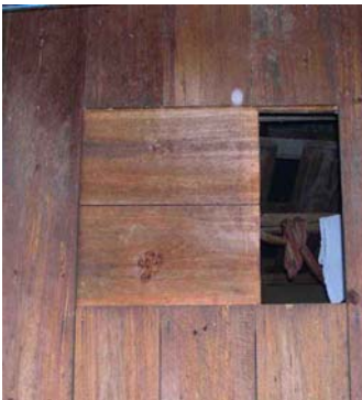
Fig. 7 - Detailed solution of windows in Santacruz Tepetotutla project.

In San Pedro Tlatepusco, families turned hosting small groups of students for daily meals, so as not to impact too much on their family life rhythm; this solution however allows less control on the quality of food and wasn't replicated in the other two projects, also for communities choice. In Pensamiento Liberal, the women of the cooperative have turned in a single common kitchen providing meals to all students for the entire duration of the project, spending almost their entire day in this task. The attention with which these issues are examined at the moment to arrange with the community, as well as the manner and timing of the management of local resources through the authorities of the village are crucial for the success of the project.