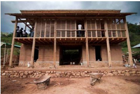
Fig. 4 - Micro-Regional Innovation Center in compound in Pensamiento.

An example that clarifies this approach is related to the process by which the wooden structure (present in all three projects) was designed, considering the related implications in the later step of the construction. Starting confronting with the community, we defined the basic size of wooden pieces to compose the whole structure, according to the material local production processes; these elements are then assembled in the final design in order to enhance both structural and environmental performances, considering at the same time, construction processes that local workforce could manage.