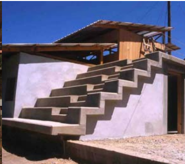
Fig. 2 - The Community Center in Santacruz.