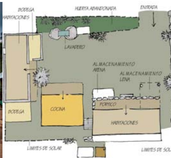
Fig. 5 - Investigation sketch of a Santacruz Tepetotutla project.