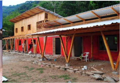
Fig. 3 - The Community Center in S. Pedro in Pensamiento Liberal settlement.

The Community hosts students for the period of works (2-3 months). We share work and everyday life in that months and it is an important experience that allow us to empower our relation with the communities [4].