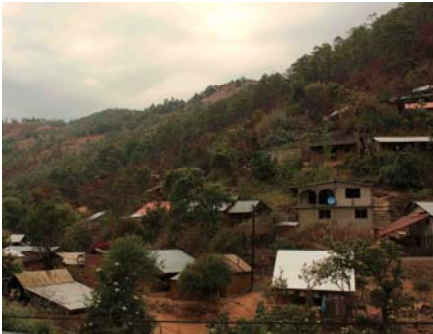
Fig. 1 - Vernacular and industrial materials.

and on quantifying construction materials and costs. Once executive planning is completed, we are ready to begin construction.