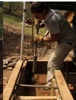
Fig. 11 - Compaction with pneumatic piston.