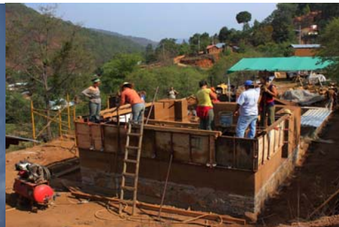
Fig. 11 - Compaction with pneumatic piston.