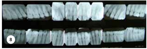
Fig 8 - Pre-operative full mouth ERSE