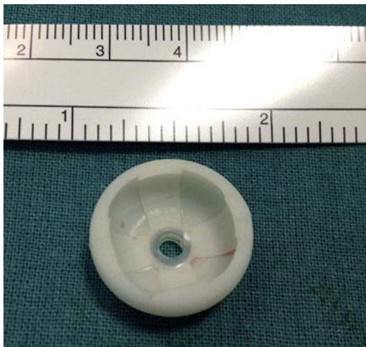
Fig. 2. Intraoperative findings: the bumper extracted laparoscopically from the umbilicus.