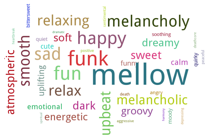
Figure 4. Cloud of most frequent affect tags

the identification of the tracks that could be distinctly fitted in one of the 4 mood clusters based on the tags they had received. We started by identifying and counting the extended set of tags in each song. For each song we got 4 counters, representing the number of tags from each mood category.