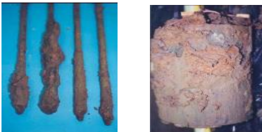
Figure2: Electro-cementation near around metal objects. a) Electrodes; b) Cylinder

S. Micic et al.(2003) studied the focus on electrokinetic strengthening of soft marine clays adjacent to skirted foundations. It was also evidenced that the soil shear strength was further increased with time after the electric field was withdrawn, attributable to electrokinetics induced soil particle cementation during post-treatment ionic diffusion. Figure 2 a) & b) showed the attribution to electro-cementation of soil particles and bonding between soil solids and steel objects at the soil-steel interface.