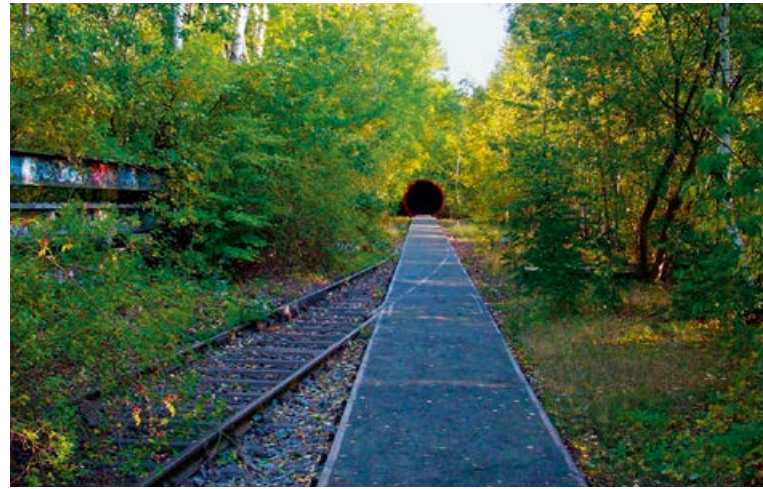
图5 / Figure 5 德国柏林自然公园沿原有轨道修建的小路 Paths following the original track in the Nature Park Südgelände, Berlin, Germany