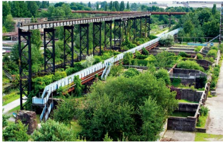
图4 / Figure 4 德国杜伊斯堡北部工业景观园中的本地植被演化 Evolution of native vegetation in Duisburg-Nord Industrial Landscape Park, Duisburg, Germany