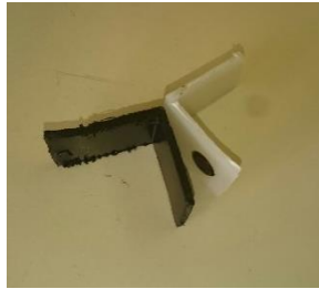
Fig. 2. Tested samples

Samples were tested by pulling tests in the two extreme conditions: