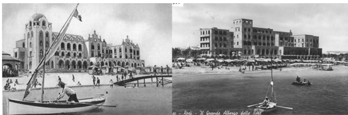
Fig. 8: The "Albergo delle Rose" in its former appearance [postcard after 1925] and after restorations [postcard after 1936].

çarşı; the church of St. John, having the hypothetical forms of the Medieval Conventual church; several barracks and schools, the Bank of Italy, the Post Office and the Puccini theater (Fig. 7). In order to make the town a touristic center, an airport was built and the harbor of Rhodes was renewed. Transformations in the northern end of the island also began in 1933: the nineteenth-century Cretan neighborhood and the Catholic cemetery were eliminated, in order to build a square, gardens, the Institute of Marine Biology and the Albergo delle Rose, together with a second luxury hotel, the Albergo delle Terme. However, despite the 1936 master plan intended to concern the whole suburban area, by integrating the smaller existing villages, the historic town of Rhodes and the new town, only a