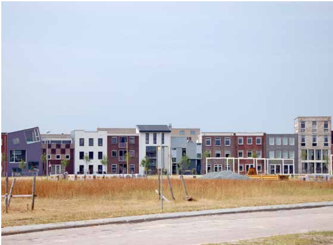
4 Almeerdestrand, nuove residenze Homerus

In many ways, Almere appears to have learned from the stalemates and mistakes made in Lelystad. 13 After the Ministry of Transport and Water Management approved the location of the city in the Verkavelingsplan (1968), the IJDA mandate for the new designers was based on four main points: the envisaged minimum/maximum number of residents (up to 2,000); residential homes more attractive than those in neighboring areas; the drafting of a reference plan during either fast or slow growth; univocal identification of the first development site. Its legacy seems to be more focused on the negative than the positive—i.e., what should not be done, the risks involved, the logic to be avoided, and the conflict between institutional actors. It was back to the drawing board to design a discontinuous urban structure; huge swathes of land where diversification of the residential supply was meant to attract inhabitants with diverse aesthetic tastes.