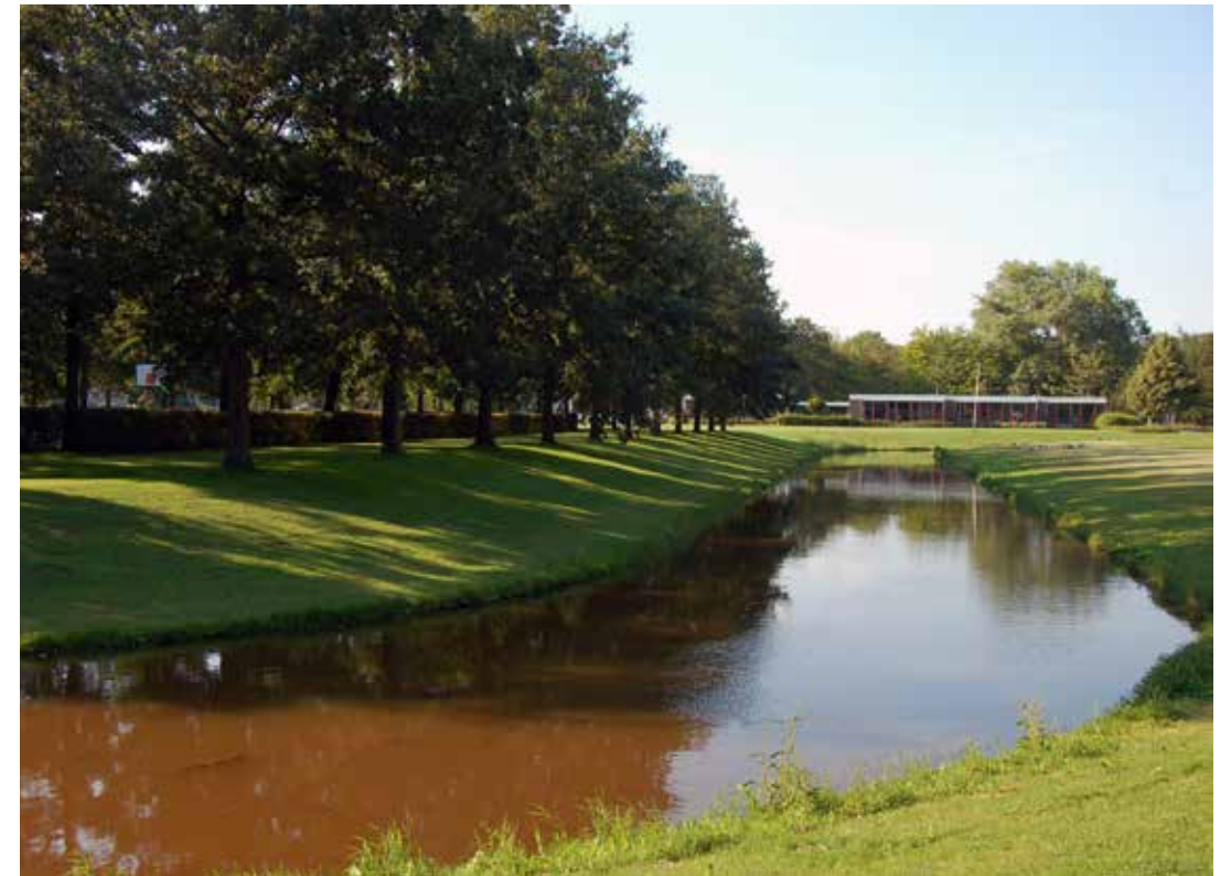
3 Nagele, gli spazi aperti centrali e la scuola cristiana protestante di Van Eyck e Van Ginkel

Nevertheless, certain topics and problematic issues seemed unsolvable. What exactly is completed urbanity? And how big does a settlement have to be to achieve it? How can