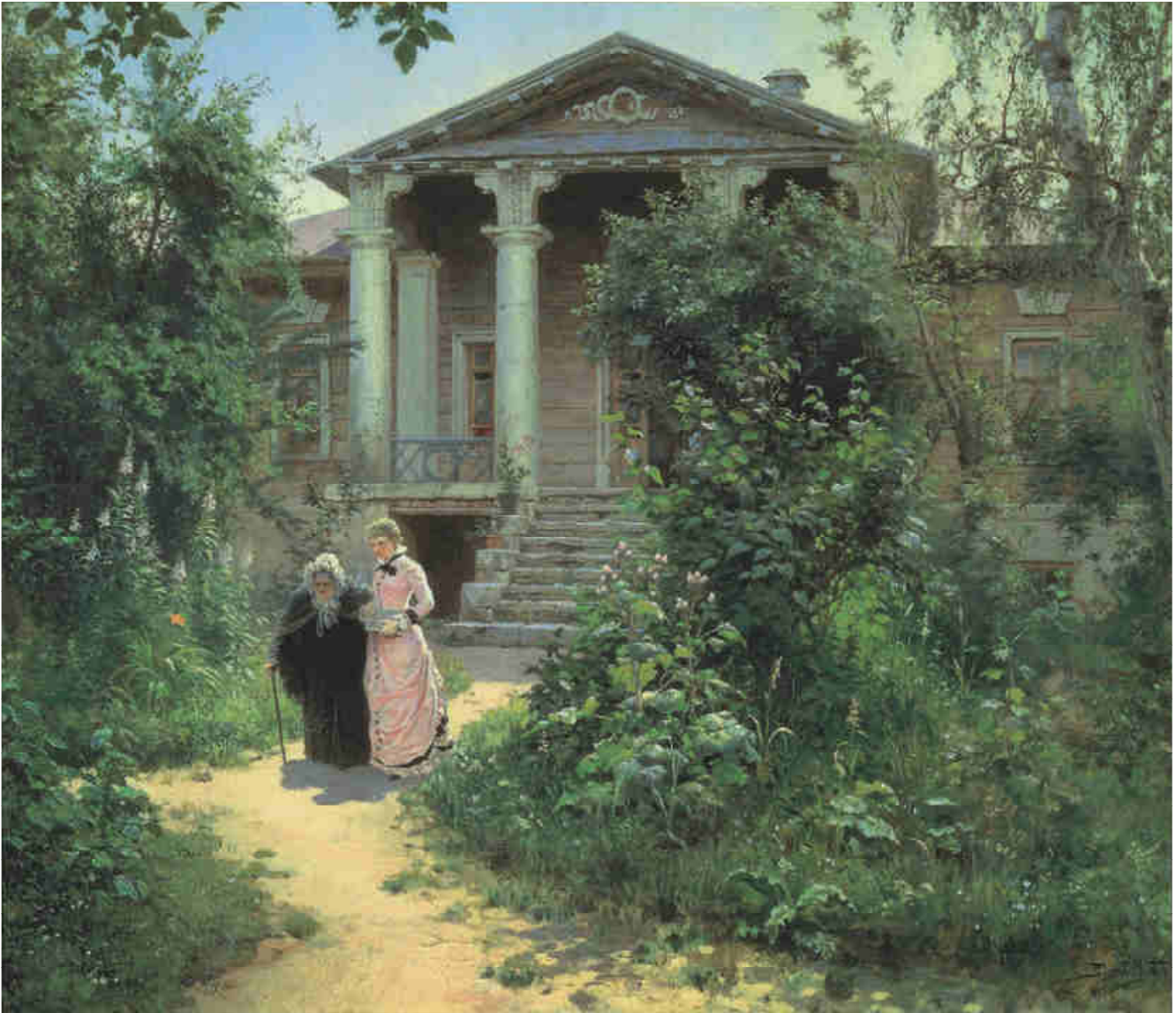
Fig. 2. V. Polenov. Painting «Grandmother's Garden», 1878.

In 1714, Emperor Peter I issued a decree on the «real estate» which was based on the property of nobiliary lands, all of them were transferred by inheritance; the land could not be lost at cards or divided into smaller parcels. Through this law the Emperor tried to protect the Russian nobility from poverty. In 1762, a decree of Peter III of the «granting of liberty and freedom for the whole of the Russian nobility» finally liberated nobles from compulsory service, extending their possessors rights.