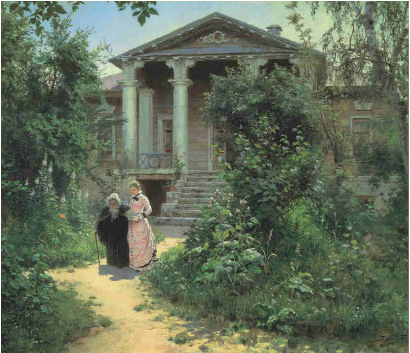
Fig. 2. V. Polenov. Painting «Grandmother's Garden», 1878.

In 1714, Emperor Peter I issued a decree on the «real estate» which was based on the property of nobiliary lands, all of them were transferred by inheritance; the land could not be lost at cards or divided into smaller parcels. Through this law the Emperor tried to protect the Russian nobility from poverty. In 1762, a decree of Peter III of the «granting of liberty and freedom for the whole of the Russian nobility» finally liberated nobles from compulsory service, extending their possessors rights.