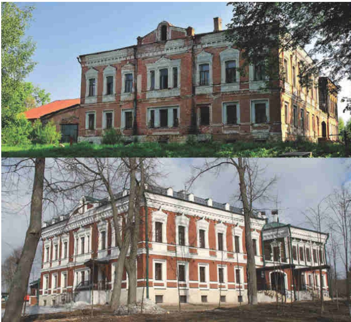
Fig. 5. Villa of merchant Aigin before and after restoration.

The main elements of such estate is the manor house and the church, standing, usually on a high place. Alley, ponds or river with the indispensable pavilion over it every time were included in the composition with a new unexpected idea. Much attention is paid to the architectural ensemble, which is subject to layout of the garden. A group of trees geometrically clipped serves as a harmonious continuation of the architectural masses. Tracks performed by ruler and compass, they form a variety of geometric shapes, sites and confusing “labyrinths”. They are bordered by clipping trees