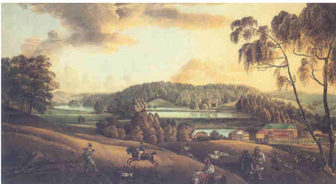
Fig. 1. Unknown artist. View of the estate Otrada, the middle of the XIX century. Source: Russian State Historical Museum. Inv. 61807/K-64

The phenomenon of Russian manor lies in the fact that it has become a unique cultivation center of Russian national culture. The majority of Russian writers, scientists, politicians, composers, and travelers grew totally in the estates. In the countryside the villa was the center of an agricultural area with villages, plowed fields, pastures, meadows, forests, rivers and lakes. A striking example of such an independent economic unit with a complete architectural ensemble is the estate Otrada in the village Semenovskoe, one of the largest non-royal residences in Russia and the largest in the Moscow region. The first owner of the villa was Vladimir Orlov, who in 1766 was appointed director of the Academy of Sciences (Fig. 1).