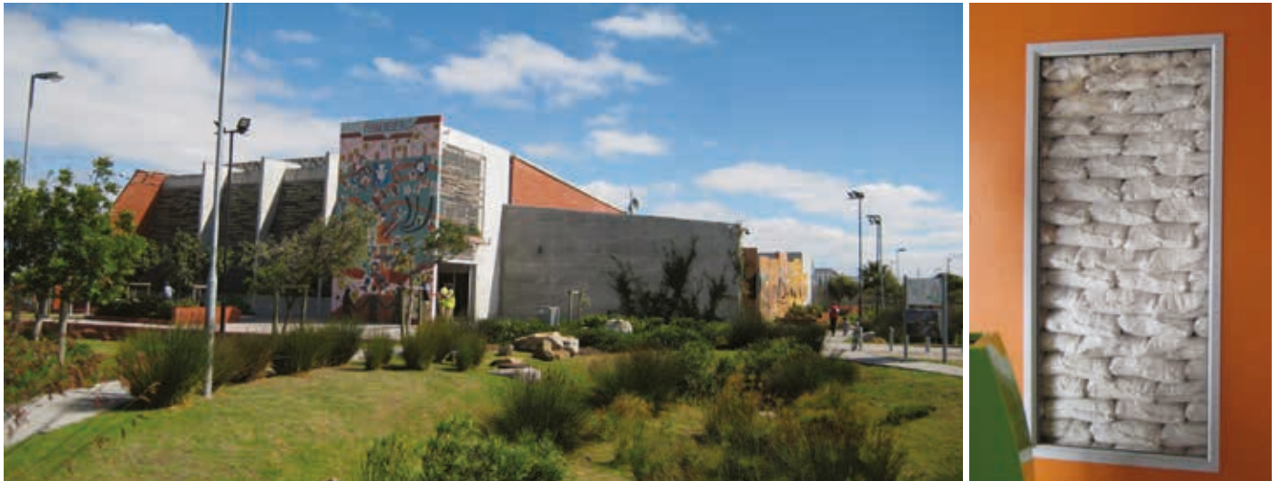
Figure 4. Photo of the Manenberg Human Settlement Contact Centre's main façade – on the left – and of the “eco-beam & sand technology” used – on the right.

Within the MyCity municipal project (Cape Town Integrated Rapid Transit – IRT – system) the SPUD department designed a skate park connected to the Garden's neighbourhood MyCity station. The vacant area below the Jutland Avenue Bridge hosts the new open-air public space since 2014. This is one of the few cases in which the City have used a waste piece of land for a special leisure need and to offer chances for encounter (Fig. 7).