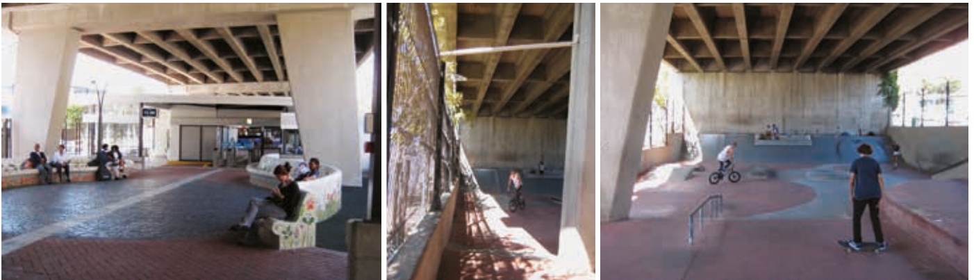
Figure 7. The photo on the left shows the Garden's MyCity station, while the other two photos show the skate park used as recreational area.

connected with the concept of the “right to the city” by Henri Lefebvre 27 and the idea of “spatial justice” proposed by Edward Soja. 28 The first notion is intended as “right to use space, right to urban life: [...] not as a ‘visiting’ right, nor as the right to shelter or seek refuge. This idea has the potential to disrupt long established paradigms of urban order and planning.” 29 This is the objective that Cape Town planning must pursue. Inclusion and “interracial contact has increased slowly over the past