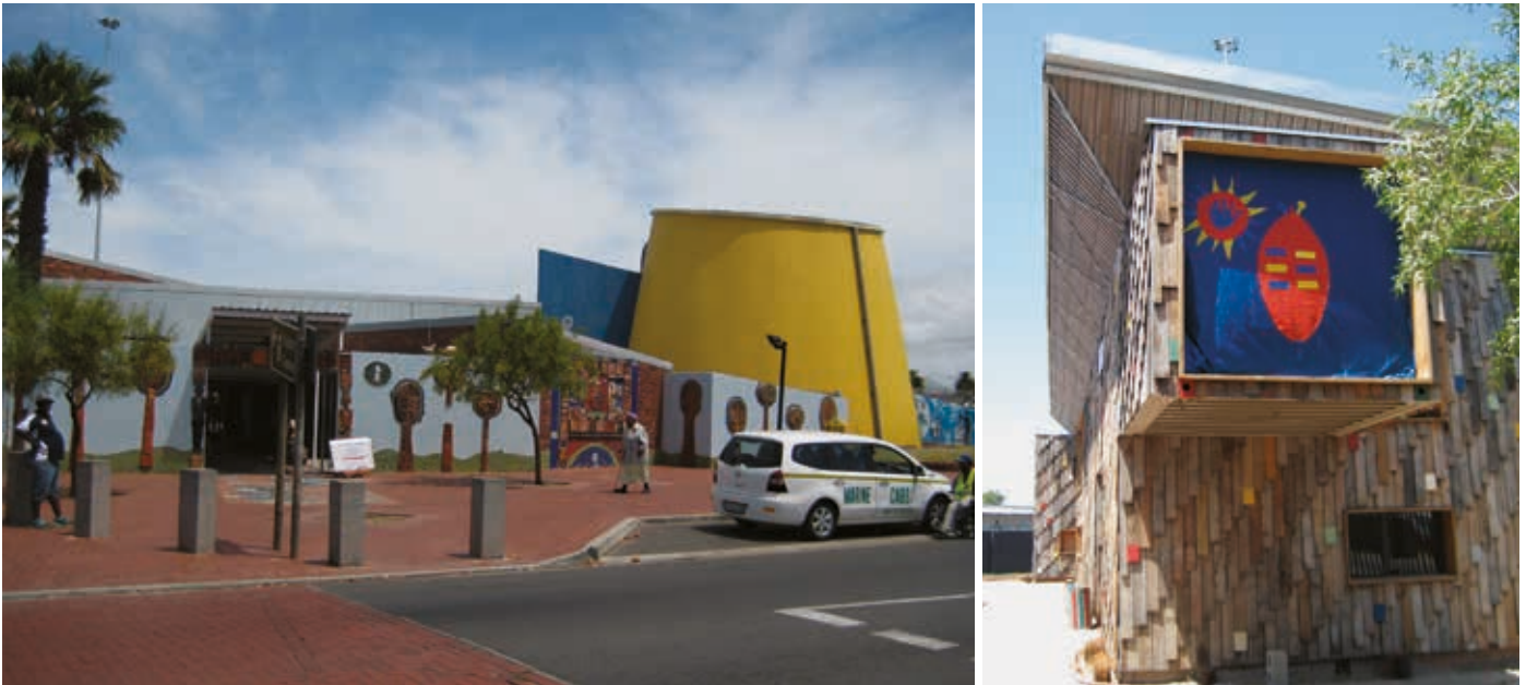
Figure 2. The photo on the left shows the Guga S'Thebe cultural centre's entrance. On the right, the new theatre.

In the same year, thanks to initiatives of non-governmental organizations, private associations and architects, some innovative projects have been built within the boundary of Cape Town and some experiments and innovations have been proposed in order to address the significant housing problem. Nevertheless, we will concentrate on the public facilities and spaces for encounter and inclusion completed in the last two decades. Some examples are presented below. The comprehensive understanding of each case study would require a much deeper analysis. And this is not the aim of this paper. The objective instead is to show that different and multiple projects have attempted to foster inclusion; and to state that those interventions would be inconceivable 25 years ago.