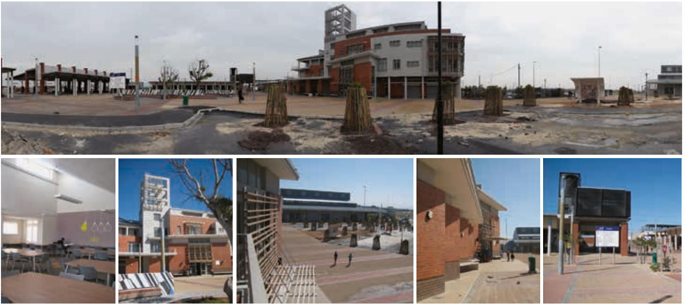
Figure 6. The panoramic photo shows the Kuyasa interchange project, with the taxi rank on the left, the station and public transportation connection in the centre and the shops and library's building on the right. The small photos show – from left to right – the interior of the library, the façade of the main building that is hosting the library on the first floor and will host economic activities on the ground floor, a view from the library's terrace towards the sport facilities on the opposite side of the street, a detail of the use of materials and the connection towards the transportation interchange.