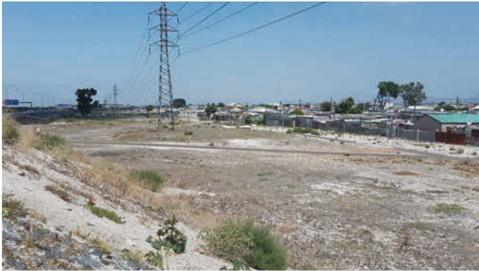
Figure 1. This photo shows how roads are used as means of separation, in which crossing is not easy and even dangerous. As a matter of fact, highways and overhead power lines have been used to divide racial groups and to control entry or exit points of settlements.

are evidences of the ongoing process of desegregation. These evidence can be traced from the 1990s through the analysis of three main elements: firstly, the publication of articles and books; secondly, the changing policies about public spaces, and thirdly, some innovative projects carried out mainly in the township areas. Such evidences might serve as markers of movements towards inclusivity.