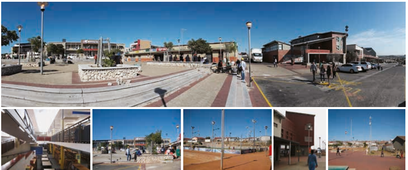
Figure 5. The panoramic photo shows Harare Square, the core of the Harare project. The small photos show – from left to right – the interior of the library, a detail of the Harare square, a soccer field space, one “Activity Box” next to the station and a portion of the Urban Park.

Within the MyCity municipal project (Cape Town Integrated Rapid Transit – IRT – system) the SPUD department designed a skate park connected to the Garden's neighbourhood MyCity station. The vacant area below the Jutland Avenue Bridge hosts the new open-air public space since 2014. This is one of the few cases in which the City have used a waste piece of land for a special leisure need and to offer chances for encounter (Fig. 7).