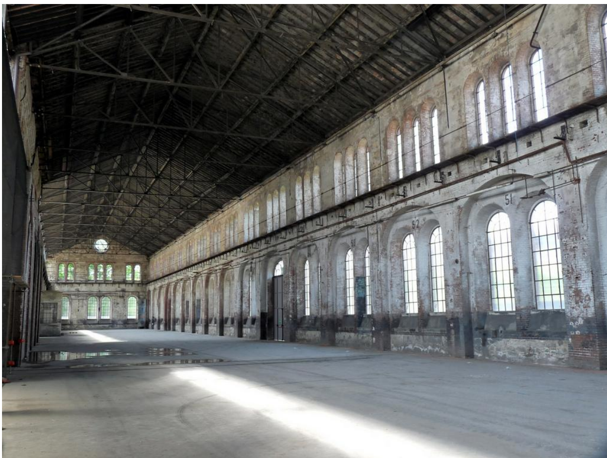
Fig. 3: Officine Grandi Riparazioni, Torino.

Aversa | Naples 16 - Capri 17, 18 June 2016