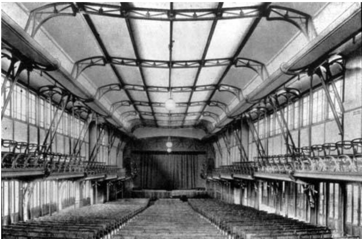
Fig. 1: "House of the People", Brussels, Victor Horta.

Unlike performances so fantastic and imaginary, a mirror (with particular attention to the third space) will be the bearer of metaphors (visual and not) of the strong need of reflection - both personal and collective – that is increasingly urgency?