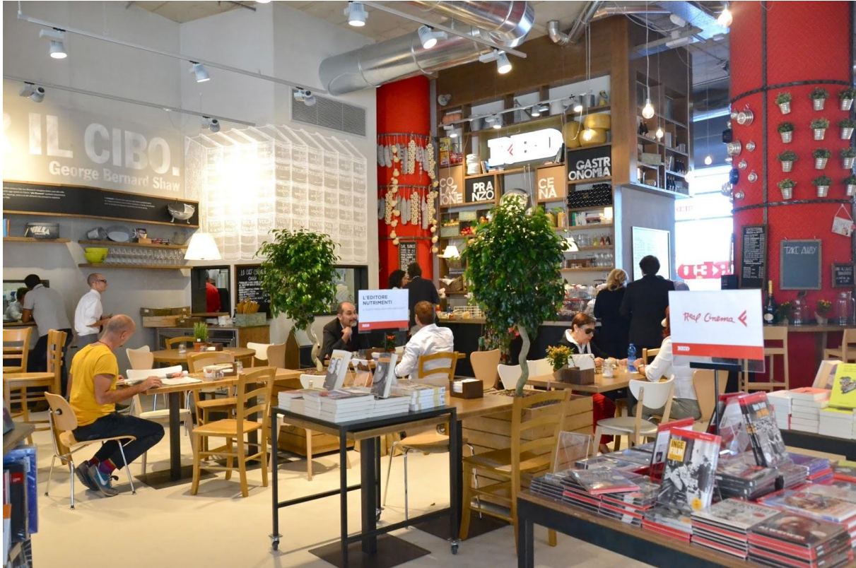
Fig. 5: the Feltrinelli Red, Milano.

Aversa | Naples 16 - Capri 17, 18 June 2016