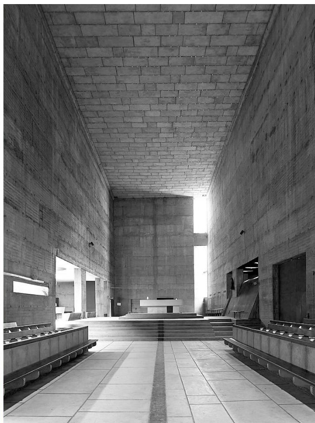
Fig. 2: The chapel “La Tourette”, Arbresle (France), Le Corbusier.

The example of a place of silence in “Third Place”, shielded from external electromagnetic waves and noises to prevent that cell phones and networking devices may disturb the peace. The main stress for those who live in the city is noise pollution, and this is true for the Christian and the Muslim, the rich and the poor; together in a secular chapel everyone will talk to their God, but meanwhile will save the soul from daily hell of city life.