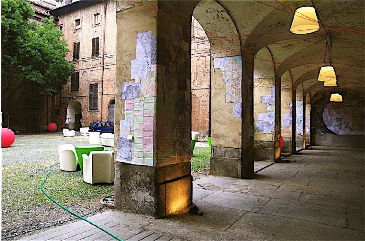
Fig. 4: Cavallerizza Reale, Torino, installation.

Aversa | Naples 16 - Capri 17, 18 June 2016