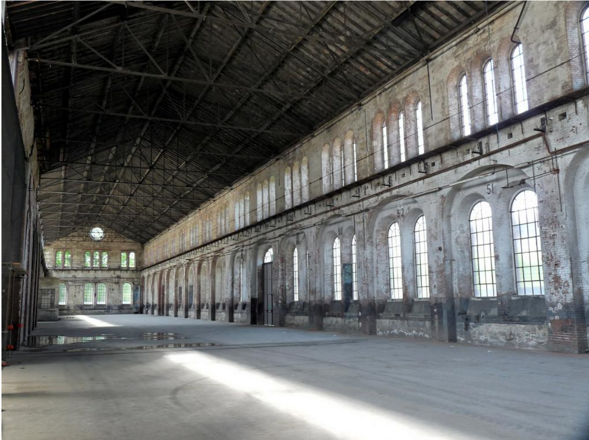
Fig. 3: Officine Grandi Riparazioni, Torino. Image taken from website http://www.nuovasocieta.it/metropoli/alle-officine-grandi-riparazioni-nascera-il-centro-nazionale-big-data/ .

Aversa | Naples 16 - Capri 17, 18 June 2016