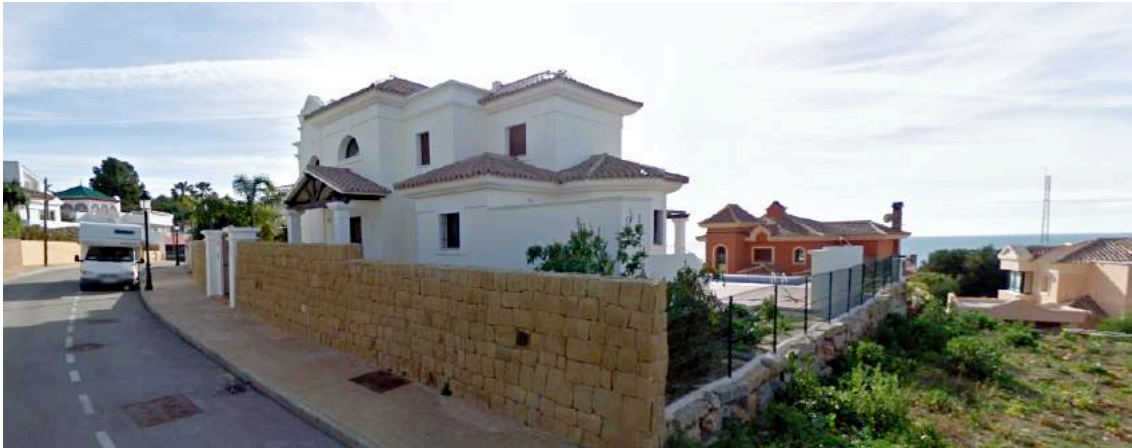
Figure 5. Urbanización Puerto de Estepona

tall dwelling complexes with clay tile roofs and walls of white, beige, or earth-toned stucco (Figure 5).