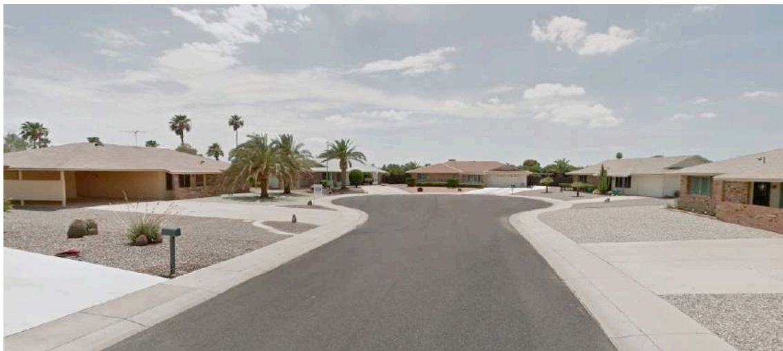
Figure 3. Sun City’s housing.

The attempt to show and live an eternal youth is clear in the plethora of activities carried out by the elders of Sun City, starting from volunteering to the different clubs (art, dance, theatre), to gardening and especially sport. The favourite sport, since the beginning, is golf and it is no coincidence that the preferred vehicle is the golf cart.