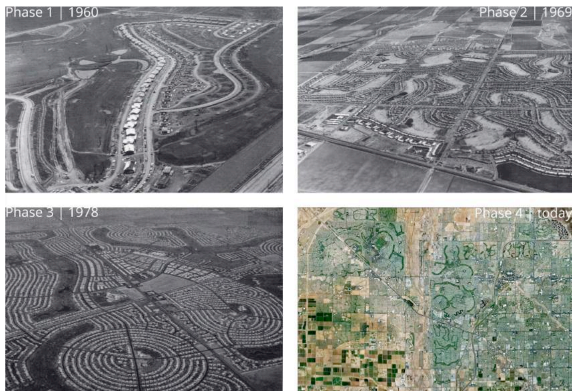
Figure 2. Sun City's the different phases of construction.

To date, according to the 2010 census, Sun City has a population of 37,500 inhabitants, while Sun City West has 24,500 inhabitants.