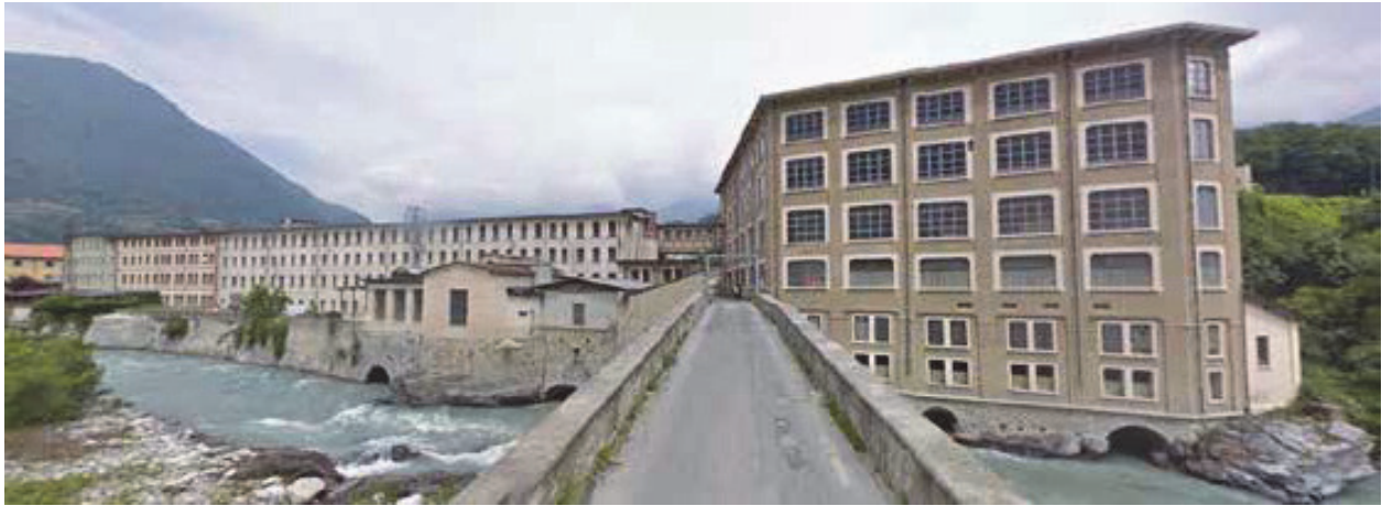
Fig. 1. The Gütermann silk factory of Perosa Argentina (Google maps).

Therefore, industries play a dichotomous role in the Waldensian identity, and this is also reflected in the recognition of the factories as Cultural Heritage by the specialized Office of the Waldensian Board: nowadays there are no productive buildings marked as “historical sites”: in this category are included more atavistic monuments (D. Jalla 2009, D. Jalla 2010).