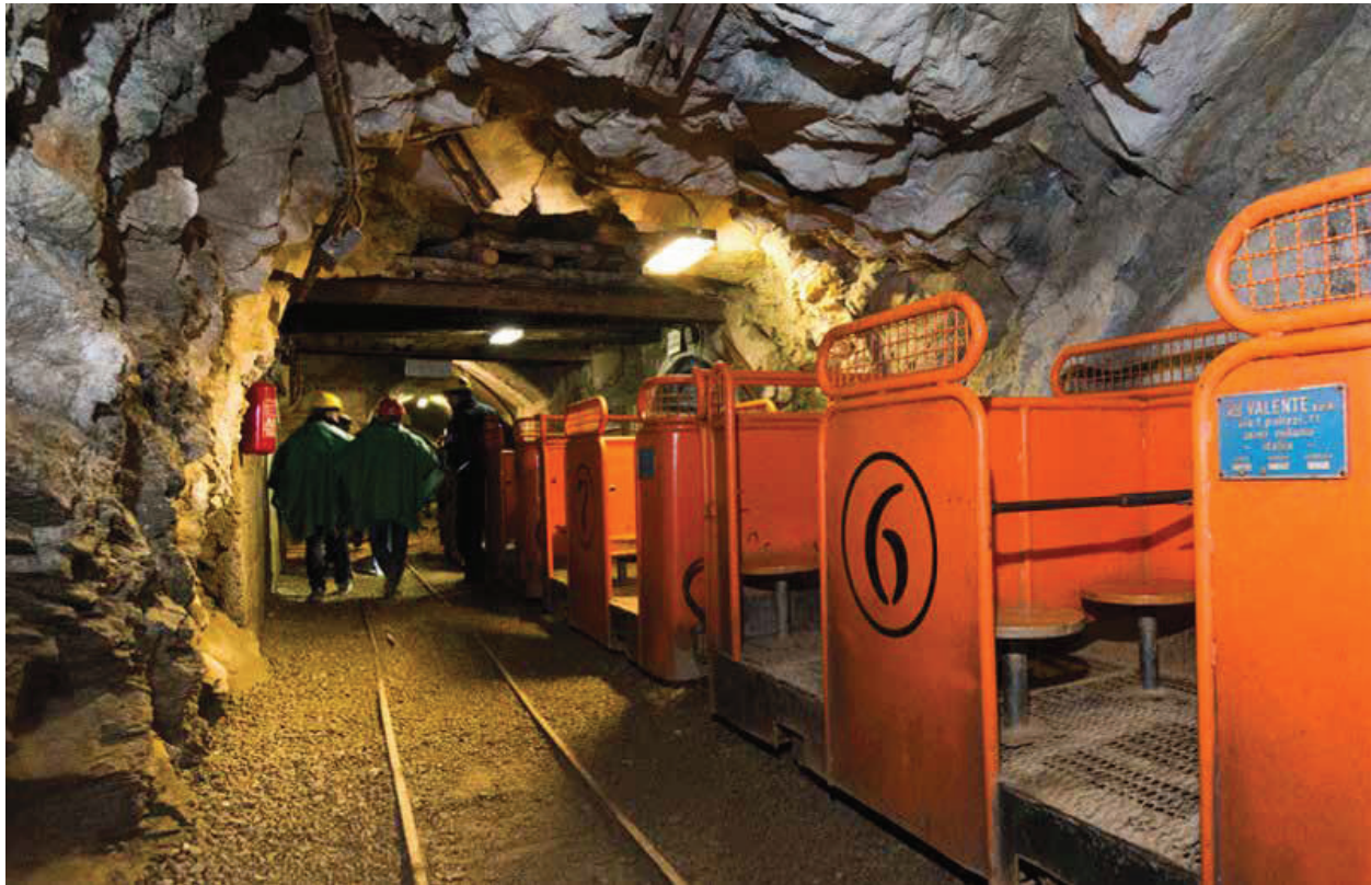
Fig. 2. Educational activities in abandoned mines of Prali ( www.ecomuseominiere.it/visite/scopriminiera/ ).

For example, we remember the aforementioned project “Ecomuseo delle miniere e della valle Germanasca” of Prali; the association “Ecomuseo delle attività industriali di Perosa Argentina e valli Chisone e Germanasca” of Perosa Argentina; the “Difiloinfilo” path, at Pomaretto and Perosa; The “Ski Rochon” Museum of San Germano Chisone, where a small section of it is devoted to the activities of the Widemann cotton mill; the “Museo della Storia della meccanica e del Cuscinetto” of Villar Perosa. The latter in particular is a highly distinctive and catalyst element of the whole Val Chisone: it is an expression of the entrepreneurial ability of the Agnelli family, which influenced the town and the whole valley up to Pinerolo through innumerable works and political action. The city government is currently preparing a memory circuit of this family through the systematization of their historical places, and the setting of a permanent exhibition entitled “l’Avvocato e la sua Valle” in the building called “Finestra sulle Valli”.