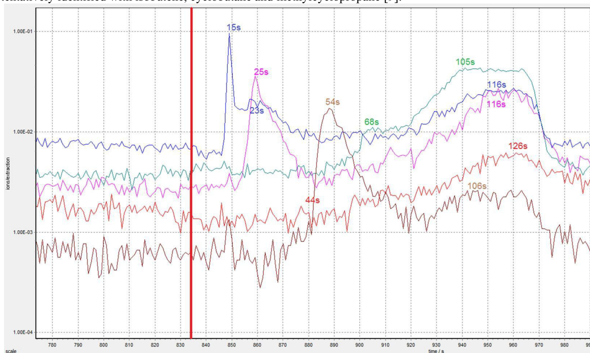
Figure 2 – Natural gas isomers identification for some trace compounds: blue) C 4 H 8 , pink) C 2 H 6 O, brown) C 7 H 8 , green) C 2 H 4 O 2 , red) C 10 H 14 .

The concentration and the elution time of the peaks for the isomers identified in the natural gas are reported in Fig.2 and Table 2. Peaks for C 4 H 8 , C 2 H 6 O, C 7 H 8 , C 2 H 4 O 2 and C 10 H 14 are reported in figure 2. The highest ions extraction rate was identified for C 4 H 8 with the first peak that eluted from the column at 15 s. At 23 s and at 116 s two other peaks are identified. In this condition at 57.07 g/mol it is possible to identify three isomers that can be tentatively identified with isobutene, cyclobutane and methylcyclopropane [9].