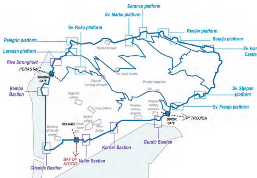
Figure 3: The elements summarized in the city map of Kotor.

and are called Contarini (14th–15th century), Zen, the Great Battle (1768), Renier (1768), Soranzo, Loredan (15th century), Priuli (1767) and Molin, all names of the Venetian supervisors during their service these were built. The ramparts Corner and Valier and the fortification between these ones along the coast were built after the 1667 earthquake; the bastion Corner has been little explored unlike the bastion Valier which has been investigated on several occasions. Inside there are the remains of the medieval fortifications as well as those of a door of Romanesque-Gothic style, dating back to the 14th century [4]. On it was done a project of valorization and cleaning of the Serenissima's symbol: the lion. It is so important that it is found very often in the city: on the buildings, along the walls, on the doors. It is also present on the entrance of the path along the walls; actually today it is possible to follow it and get to the top, from where one can enjoy a breathtaking view of all the bay.