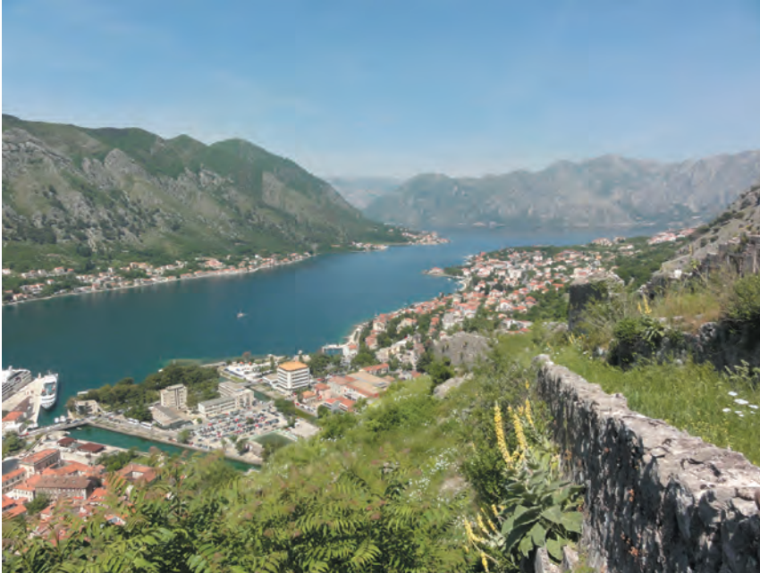
Figure 8: The incredible landscape in which the fortified city is inserted seen from the higher part of the Kotor's walls.

be a negative aspect for the conservation of the cultural heritage. Ulcinj lush vegetation along the walls, the lack of attention to the protection of archaeological sites in the historical centre and the construction of new facilities with inadequate materials and of new architectures divorced with the context are all critical elements.