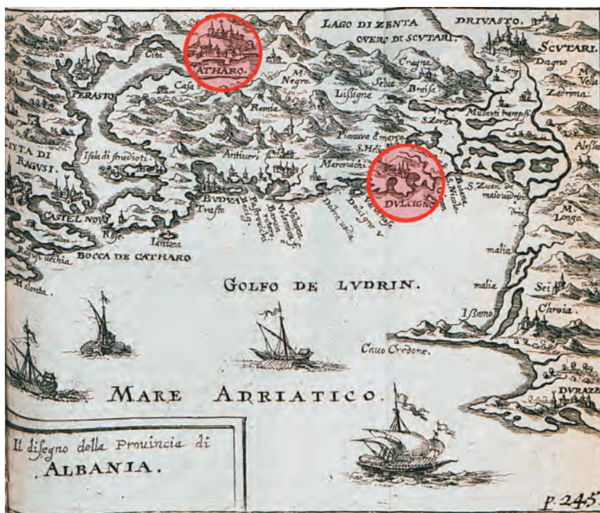
Figure 5: Kotor and Ulcinj, on the Adriatic coast, are here highlighted: they are part of Albania Veneta.

of immense Cyclopean walls still visible. The town was frequented by Greeks who might have settled their trading centre using the existing port facilities; subsequently it became autonomous municipality with the name of the Roman Olcinium or Ulcinium and played an important commercial role at the crossroads between the hinterland and the opposite shores of the Adriatic, and it so easily acquired the Latin Mediterranean culture. In 1405 the Venetians conquered the town that remained under the Serenissima for 150 years. Under Venetian control, the city was renamed Dulcigno in Italian, and it was incorporated in the Albania Veneta (Fig. 5) (area between the Bay of Kotor and the mouth of the Bojana River) [6]. It had a strategic role as a crossroads between internal city and the sea that makes Ulcinj, in the short period of Venetian rule, a great trading post (Fig. 4).