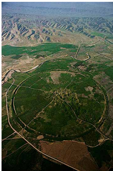
Fig. 1. Drawing Aerial photo of the Sassanid circular city of Gur

Its distinctive circular plan, is divided into 20 parts, radially structured and extends over a plain