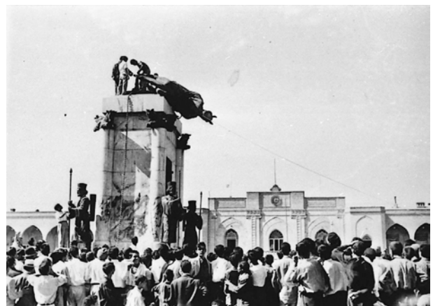
Fig. 5. Drawing Pulling down the statues of Reza Shah Pahlavi (r. 1925–1941) in Sepah Square (currently Imam Khomeini Square, also called Toopkhaneh Square which is literally means Artillery Square), Tehran's main square, 18 August 1953.

In this sense, the first modern great square of Tehran, which was named Toopkhaneh, meaning "the Cannon House," was physical evidence of the use of urban design by the ruling power to control the society since it became an urban element of defense against public uprisings and social demonstrations" (Milani 2004). The continuation of the monarchy (palace) and the absolute power of the ruler, the intermediary role of religion (mosque) and economic institutions (bazaar), and the symbolic notions of order and direction have all had direct implications on the urban form of Tehran, even today; the axial form of the city, which caused the segregation of the poor and the rich, derived from the historical segregation of the ruler and the ruled, is the other observable consequence of the power structure on the urban form of Tehran (Madanipour 1998). Milani uses a term that Walter Benjamin had used in The Arcade Project about Paris; he interprets the essence of a famous square in Tehran, which was built as the first touch of the modernity in 19 th -century Tehran, as an essence of the use of urban design to prevent social uprisings, and to fight as follows: "There was Toopkhaneh, a square whose military function and ominous name (Cannon House) were reminiscent of what Benjamin calls the 'Haussmannization of Paris', an attempt to use urban