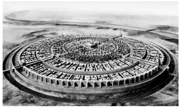
Fig. 2. Plan of the round city of Baghdad in the 10th century, the peak of the Abbasid Caliphate