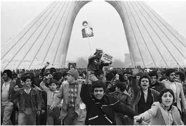
Fig. 6. Revolutionaries gathered at a massive demonstration in Tehran on Feb.8, 1979. (npr.org 2009)

Shahyad (now Azadi/Freedom) square. Leach highlights the crucial role of social ground of architectural form when removed from its contextual situation. He argues that “Monumental Architecture achieves its political status through semantic association depends on an historical memory within the collective imagination. Once this memory fades, the building may be appropriated based on new ideological imperatives” (Leach 2004: 118–120). The utility of these contemporary squares as the place of encounter with the ruling power in the modern era are demonstrably related to the historic relation of the idea of Meydan (Maydan or Midan) in Islamic cities. The Shahyad (now Freedom) monumental square associated with various political positions, which is depended upon the collective memory and public imagination. What was happened in this iconic Square of Tehran was the prolonged and mass occupation of public squares by citizens that represented the public square as the archetypal “center stage” upon which collective action is symbolically meaningful (Fig. 6). The square became widely known as Freedom (in Persian language: Azadi) Square after the 1978 Iranian Islamic revolution and officially renamed after the 1978 Iranian Islamic revolution. By its ordering role as the spatial center of the nation and by its name, this space was important in the production of modern citizenship.