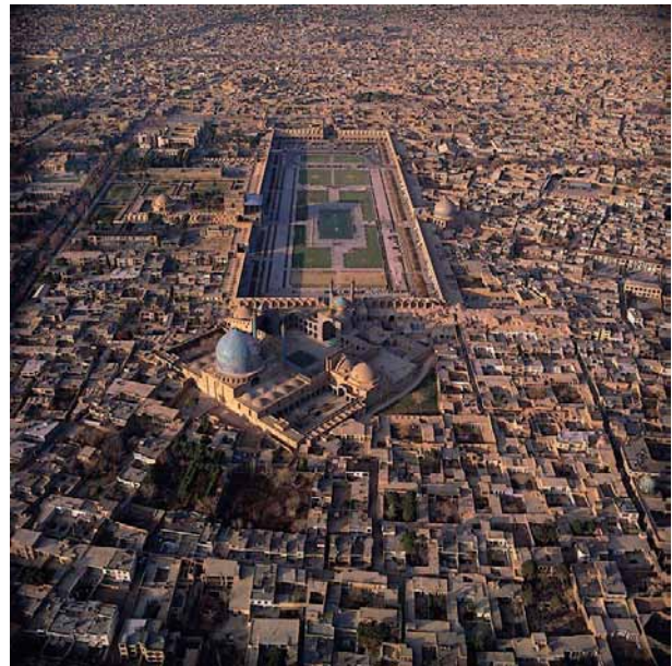
Fig. 3. Aerial photo of Naghsh-e Jahan Square

Gideon suggested that the impact of religion on architecture could be explained by man's desire for a prolongation of life and for a constitution of existence after death in ancient Middle Eastern architecture (Giedion 1981: 9). According to Gideon, the joy of celebrating under the sky but within the enclosure of courtyard houses evokes a sense of continuity and eternal existence (Giedion 1981: 138). Based on Sumerian cosmology, the universe consisted of heaven and earth (An-Ki), which was united until Enlil (God of air), se-