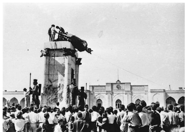
Fig. 5. Drawing Pulling down the statues of Reza Shah Pahlavi (r. 1925–1941) in Sepah Square (currently Imam Khomeini Square, also called Toopkhaneh Square which is literally means Artillery Square), Tehran's main square, 18 August 1953.

In this sense, the first modern great square of Tehran, which was named Toopkhaneh, meaning "the Cannon House," was physical evidence of the use of urban design by the ruling power to control the society since it became an urban element of defense against public uprisings and social demonstrations" (Milani 2004). The continuation of the monarchy (palace) and the absolute power of the ruler, the intermediary role of religion (mosque) and economic institutions (bazaar), and the symbolic notions of order and direction have all had direct implications on the urban form of Tehran, even today; the axial form of the city, which caused the segregation of the poor and the rich, derived from the historical segregation of the ruler and the ruled, is the other observable consequence of the power structure on the urban form of Tehran (Madanipour 1998). Milani uses a term that Walter Benjamin had used in The Arcade Project about Paris; he interprets the essence of a famous square in Tehran, which was built as the first touch of the modernity in 19 th -century Tehran, as an essence of the use of urban design to prevent social uprisings, and to fight as follows: "There was Toopkhaneh, a square whose military function and ominous name (Cannon House) were reminiscent of what Benjamin calls the 'Haussmannization of Paris', an attempt to use urban