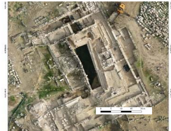
Figure 2: Othophoto of the Plutonium area and Apollo Templum.

single orthos are automatically clustered in the software. The Plutonium area (0.11 km 2 ), for example, was covered in about 10 minutes (80% overlapping in both directions) at an altitude of 57.2 m, with measurement of 20 GCPs. The Necropolis area is wider, the flight altitude is almost 100m, 0.23 km 2 with 18 GCPs, and 22 GCPs in the Thermal Bath Church (0.12 km 2 ). It is very interesting the result of accuracy of the models, which is around 1 centimeter for GCPs and around 2 cm for the CPs. This data concerning the promising precision, along with the resolution that is around 2 cm per pixel for flights of lower altitude and 3cm per pixel for the flight to the higher altitude of the Necropolis, it means that the scale of the outcomes is between 1:100 and 1:200. The main purposes of the photogrammetric flights on the areas were the revising of available documentation. In particular, for the Plouonium area, the integration with the updating data after the last excavation near Apollo's sanctuary; for the Terme-Chiesa the integration of the previous terrestrial LiDAR survey with aerial models; for the Necropolis the aerial documentation and production of an updated terrain model for pathways elevation analysis.