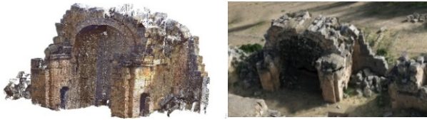
Figure 3: The entire complex and corresponding views of LiDAR model and the drone one, quite deficient in upstanding walls, especially high.

substantial completion to that with a highly detailed terrain model on the tissue of the necropolis and its domestic routes. Up until now, these data were not available and we believe that the ability to measure on a digital model every possible level or height differences within the necropolis points is an important opportunity in the perspective to continue the studies on this area. (Fig. 4)