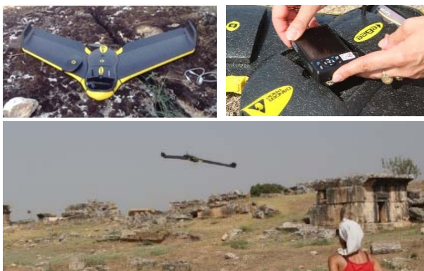
Figure 1: The setting up of the fixed wing eBee platform with the customized camera and take-off phase.

For the data acquisition, the eBee drone was equipped with the Canon S110 RGB (12 MP, CCD size 7.44 x 5.58 mm). According to the Turkey UAV regulations, platforms under 4kg of weight and under 100m of altitude could flight without any authorization. Furthermore, pursuance of the aims of the project the GSD (Ground Sampling Distance) was set up at 2 cm in order to achieving suitable information for very accurate large maps. The photogrammetric process, by Pix4D software is composed into different steps: initial processing of interior and exterior camera orientation and point cloud densification. The final step of the workflow is the production of DSM and a complete True Orthomosaic. True orthophotos are common end-products obtained from digital surface models where the aerial images are rectified from a perspective to an orthographic projection using an underlying DSM, the